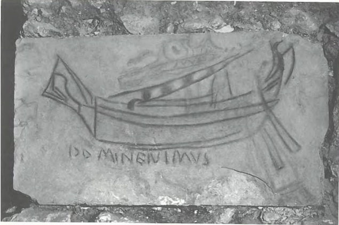
Fig. 2: Photograph taken after cleaning in 1975 (Gibson & Taylor 1994, 32, Fig. 25)