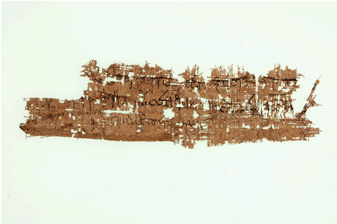
Fig. 1: P.Prag.inv. G.III 385 recto.