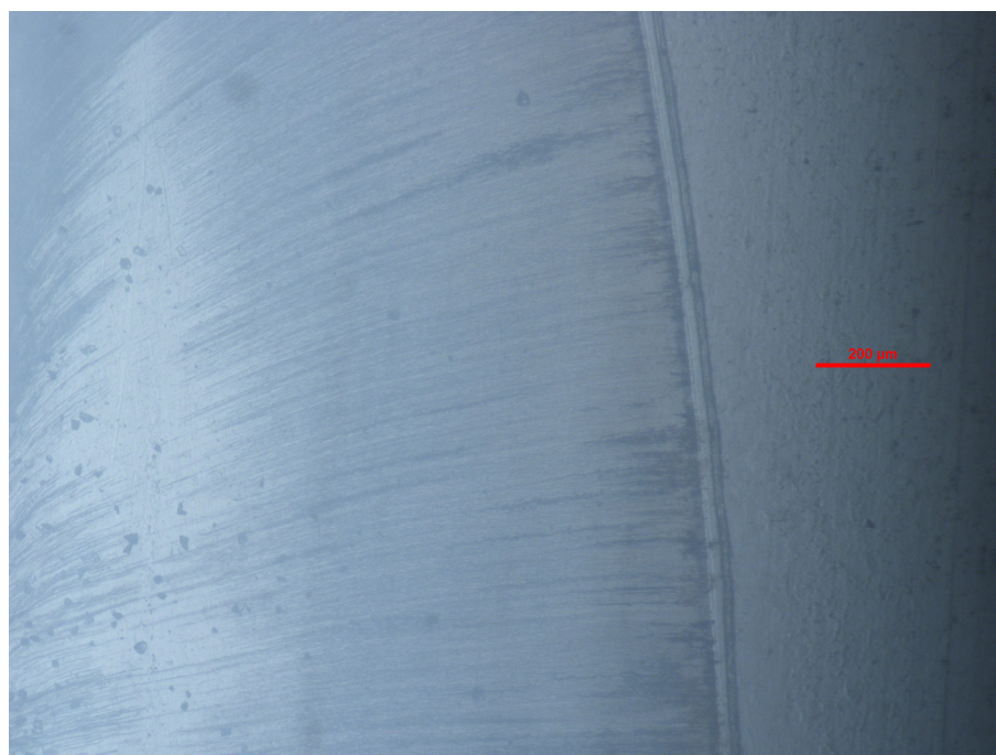
Fig. 3. Bear molar (Fig. 2, sample No. 4). The individual died aged 1.5 years towards the end of summer/ beginning of autumn. It can be seen the molar shows an unfinished summer increment, but its thickness more likely corresponds to the last third of the "summer season".