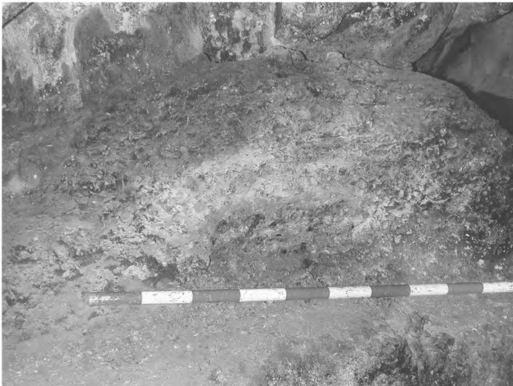
Fig. 5. Detail of the test pit excavated in April 2000 in El Alloru (Balmori, Llanes). This site was surveyed by the Count of the Vega del Sella in 1915.

In the territory that directly occupies us here (the western Cantabrian region), we have a substantial lack of data between the end of the Asturian (end of the 6 th millennium cal BC) and the appearance of the first megaliths (2 nd half of the 5 th millennium cal BC), that is to say, we hardly have any information