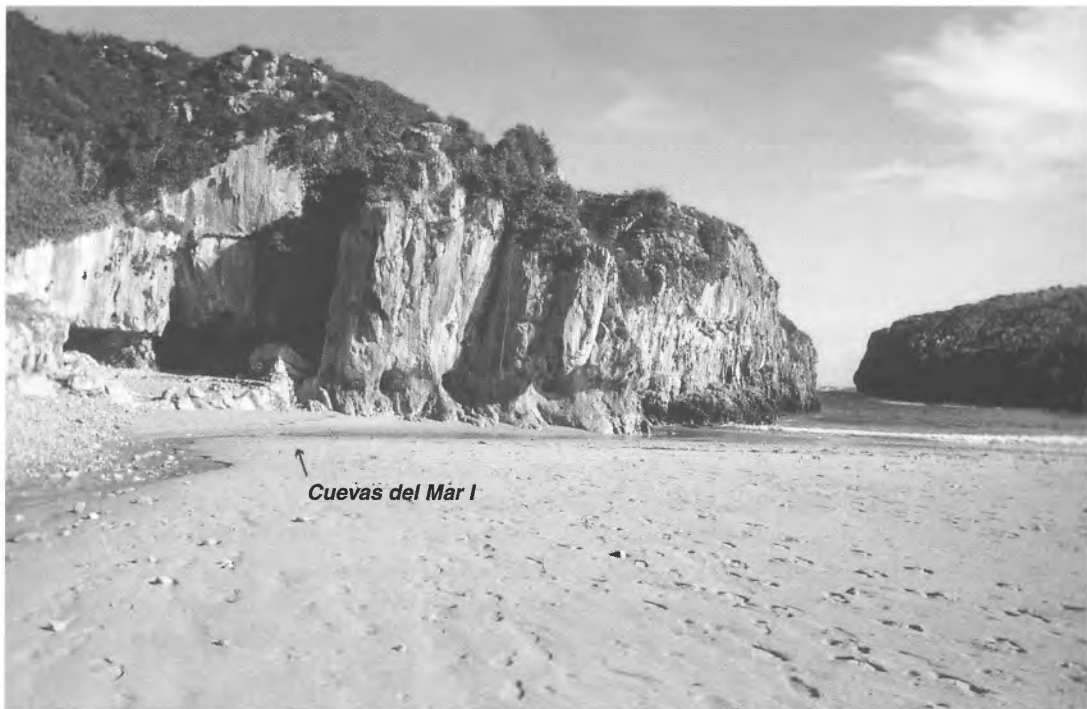
Fig. 3. Cuevas del Mar I (Nueva de Llanes): this site forms part of a cluster of caves with shell middens situated in the mouth of the Nueva River. These deposits were surveyed by the Count of the Vega del Sella in the 1920's.