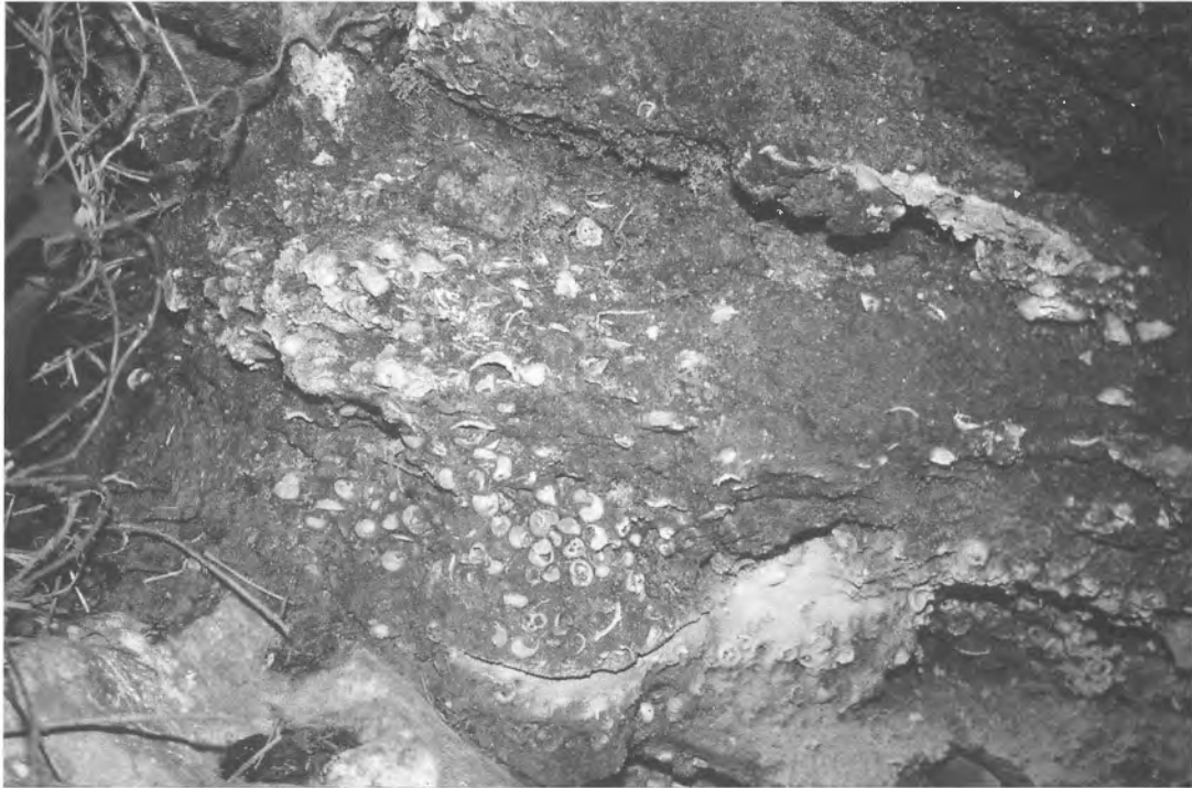
Fig. 2. Shell midden of Madalenas Cave (Vidiago, Llanes).