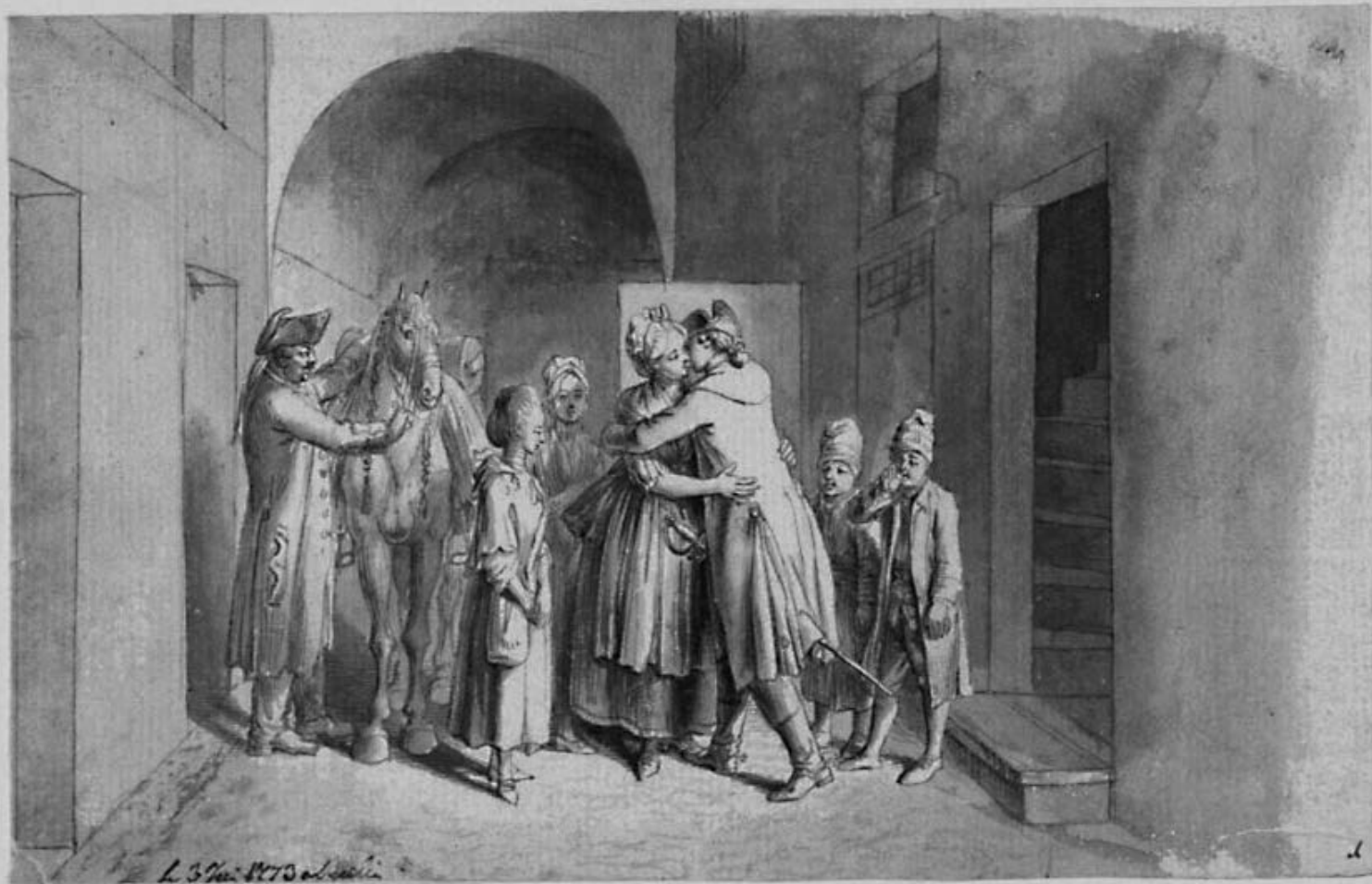
1. D. N. Chodowiecki, Farewell from the Family (3 VI 1773), ink and wash, 10,1 × 16, Akademie der Künste, Berlin, Kunstsammlung, inv. no. Chodowiecki.