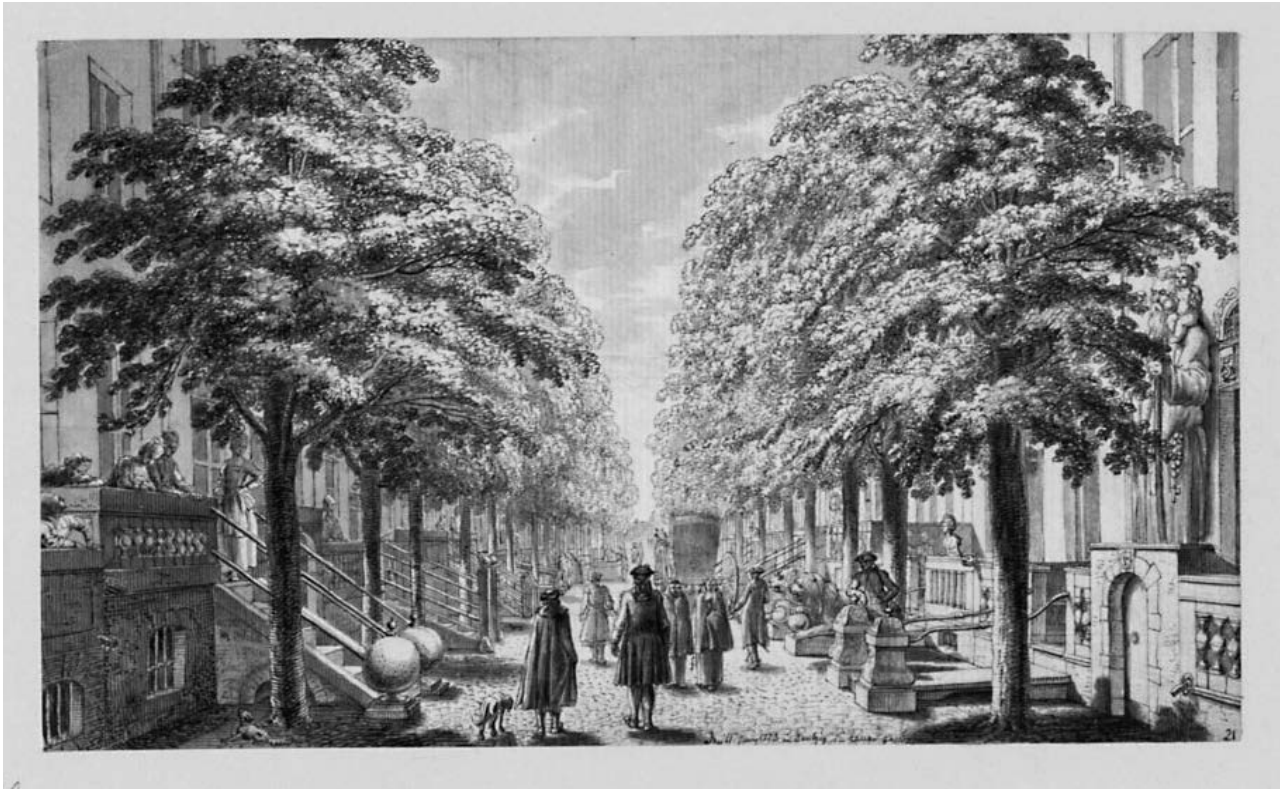
3. D. N. Chodowiecki, Długa Street in Gdańsk (11 VI 1773), ink and wash, gouache, 11,2 × 18,4. Photo: Akademie der Künste, Berlin, Kunstsammlung, inv. no. Chodowiecki 21. Photo: AdK

who is depicted. The artist seamlessly blends into the scenes. He has immersed himself in the culture of his homeland and presents himself as an integral part of the high society of Danzig. The lack of individual features and the carefully framed compositions also indicate that the series might have served a broader purpose than self-promotion. The drawings add up to a carefully constructed portrayal of a cultured society, which featured the artist at its very core.