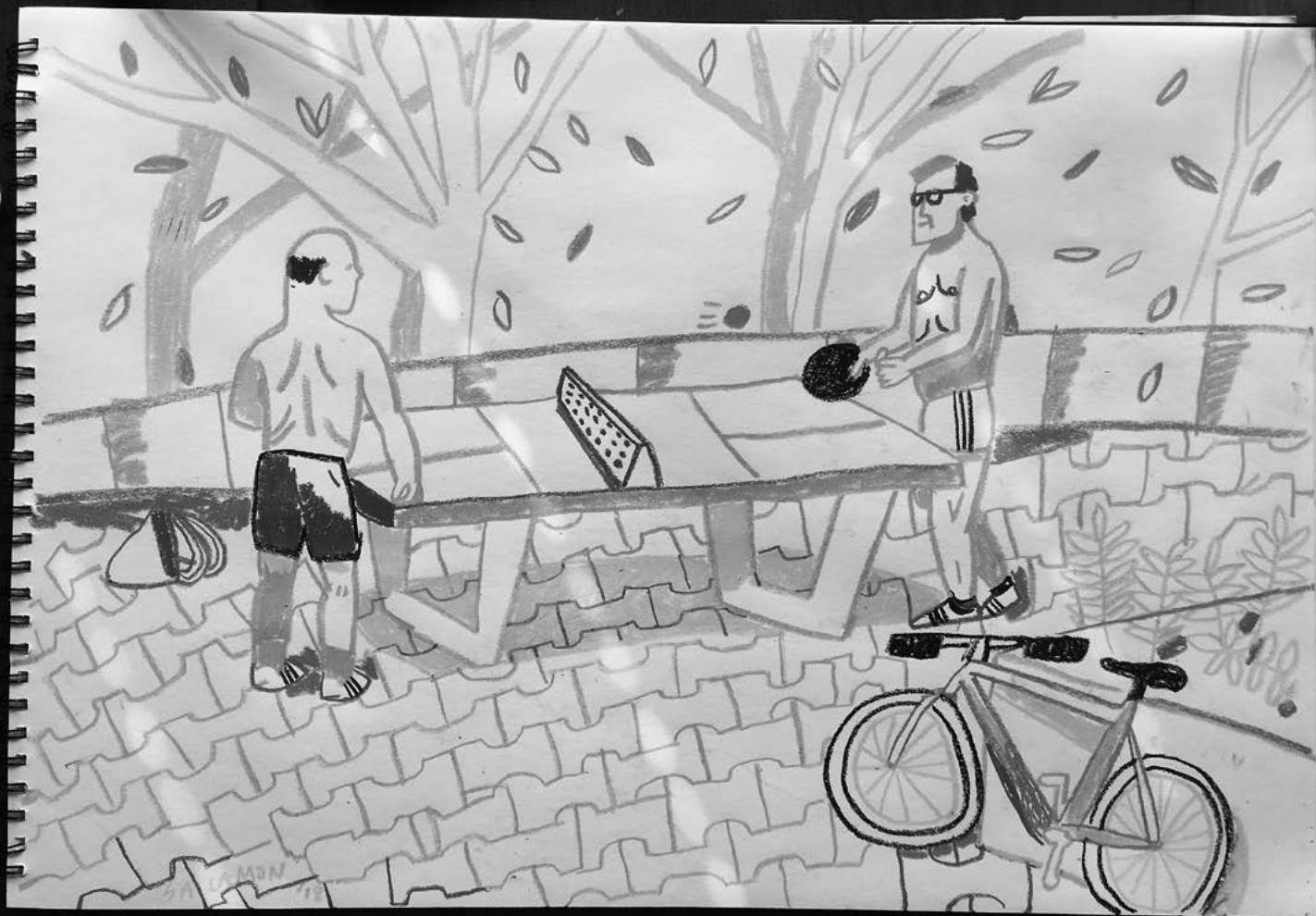
6. "From Berlin to Gdańsk", exhibition detail.

House in Gdańsk. The exhibition design was purposefully auto-thematic as well. The designers – Patrycja Orzechowska and Agnieszka Jelnicka – proposed a self-referential solution based on an idea of a travelling exhibition. Compact, light, easy to assemble and disassemble, flexible to arrange, the exhibition does not follow any restricted, superimposed order, taking the contemporary visitors' habits into account, allowing them to make their own choices as to the amount of time and attention they wish to devote to each piece, providing them with enough freedom to choose relevant individual frames of reception 40 . The play between past and presence constitutes another way to activate the viewers by slightly temporally disorienting them. It is reinforced by the selection of exhibition furniture which constitutes a mixture of antiquities and modern solutions. The dominant image drawn by Chodowiecki included in the exhi-