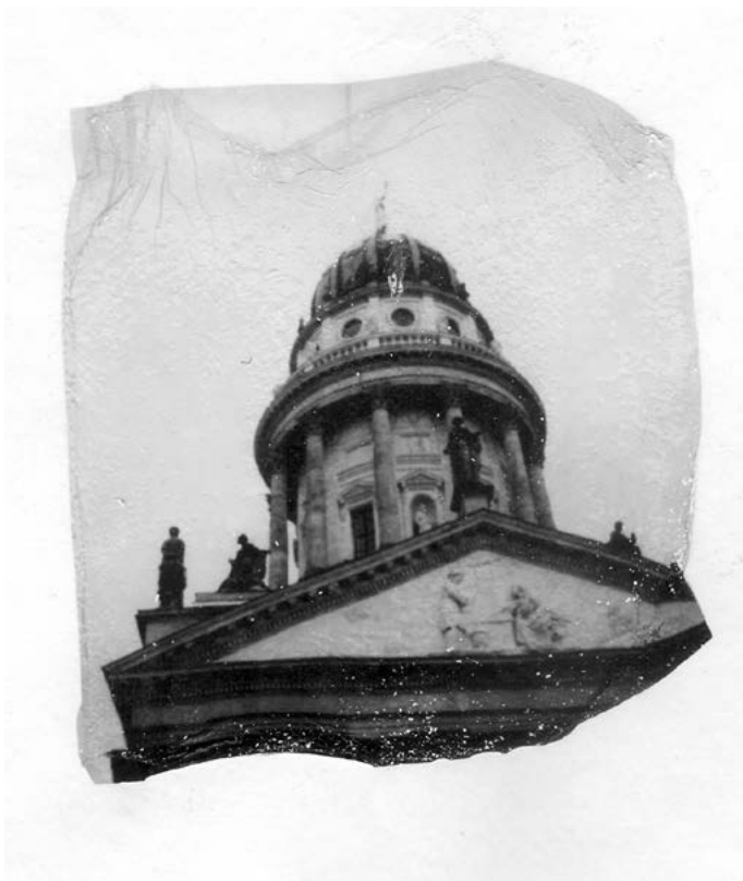
4. "From Berlin to Gdańsk", exhibition detail.

to indirectly take active part in the process of constructing local cultural identity by, firstly, reconstructing a certain set of memories, and, secondly, internalizing and interpreting the given subject connected with particular historical, geographical and cultural values, in order to build their own contemporary senses on top of it 34 .