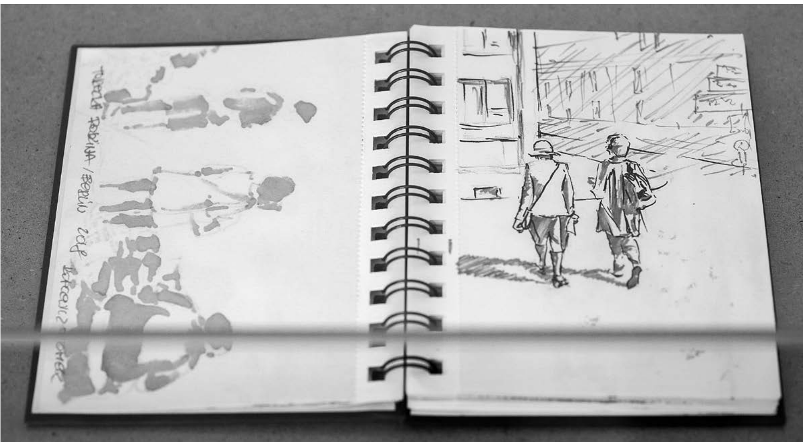
5. "From Berlin to Gdańsk", exhibition detail.

The Polaroid photographs taken by Agnieszka Piasecka [fig. 4] were created with the use of her unique experimental technique, which involves drowning the film in water in order to achieve physical deformation of the photographs, as well as distorting the colours and shapes of portrayed architecture, giving the impression of the unreality of the images, as if they were hung in between the past and the present. At first glance, it is quite impossible to date the photographs. The layer of the image peels of the photographic paper, endowing the portrayed historical architecture with a prevailing sense of transience. The imperative to attribute it to particular time and space does not apply here, as the tangibility of the architectonic images becomes secondary in comparison with their metaphysical timeless aura.