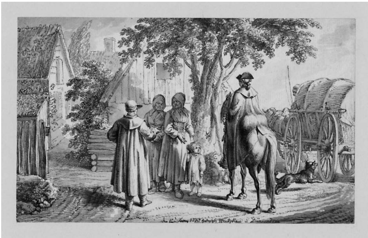
2. D. N. Chodowiecki, In a Kashubian Village (10VI 1773), ink and wash, 11,1 × 18,4. Akademie der Künste, Berlin, Kunstsammlung, inv. no. Chodowiecki 14.

What, one might wonder, is the intended function of this sketchbook, especially with regards to the finely executed drawings? It is noticeable that they closely follow the text and serve as illustrations to the latter. The personal encounters and experiences along the journey, some of them seemingly random or ordinary, are illustrated in great detail. Only rarely, such as in the scene where Chodowiecki is offered a three year old child for sale in a Kashubian village, does the spectator experience glimpses of the grim realities of the poor country population [fig. 2].