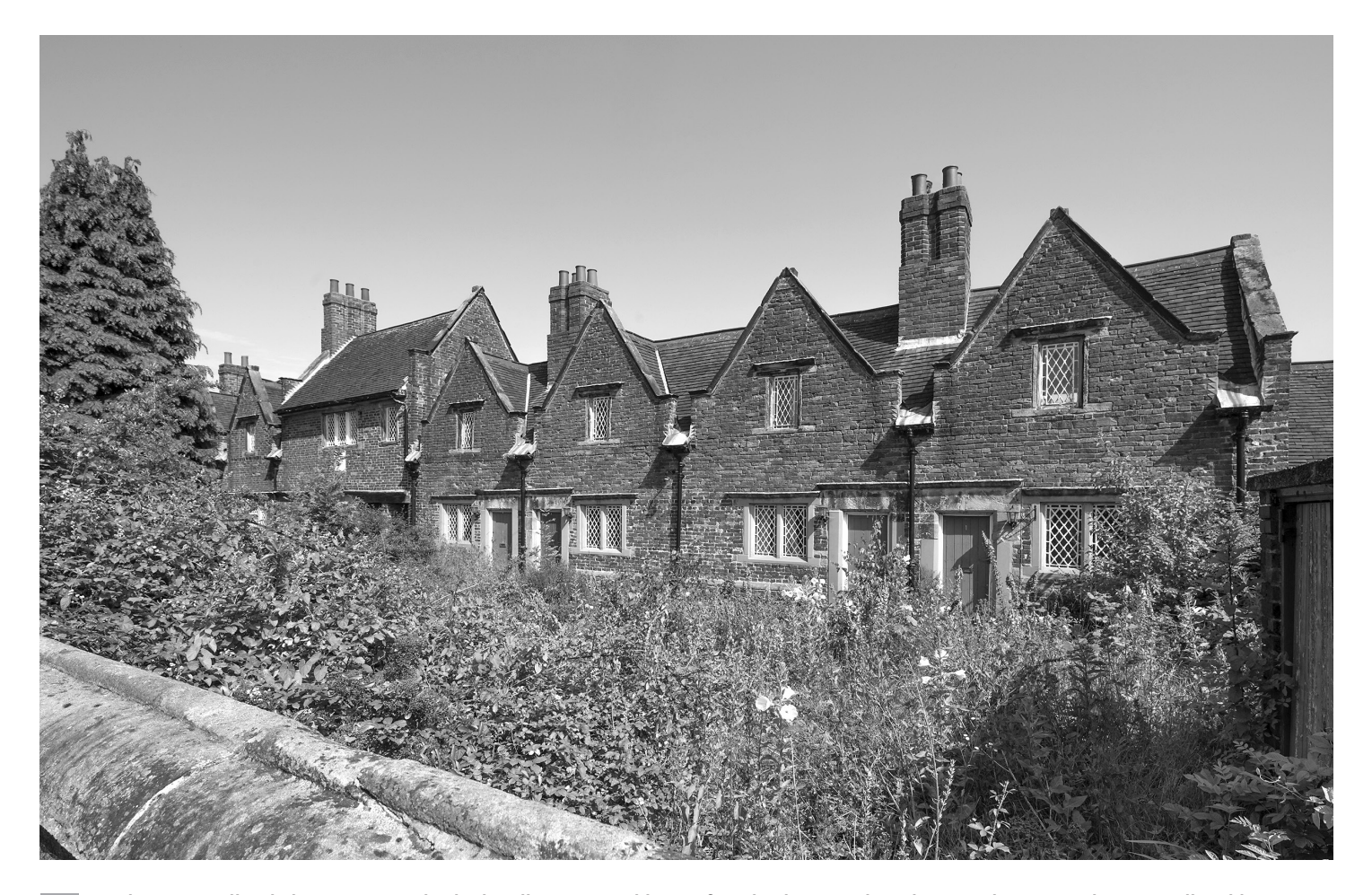
4. Clare Hartwell, Nikolaus Pevsner, Elizabeth Williamson, Buildings of England: Nottinghamshire, London 2020, Plate 62: Willoughby Almshouses (1685).

ately possible to grasp the issue of context as needing to be largely absent. As we have seen in the case of architectural photographs, vehicles, together with people's fashions or signage may date urban pictures especially, as they specifically place a building in time, place and space. From a practical point of view, creating images in such isolationist terms is difficult, and at times almost impossible without the crutch of (thankfully available today) digital manipulation. For me as a practitioner, this raises ethical issues about truth and authenticity for the buildings themselves, where does one draw the line with objectivity and representation in the manner required for this body of photographs?