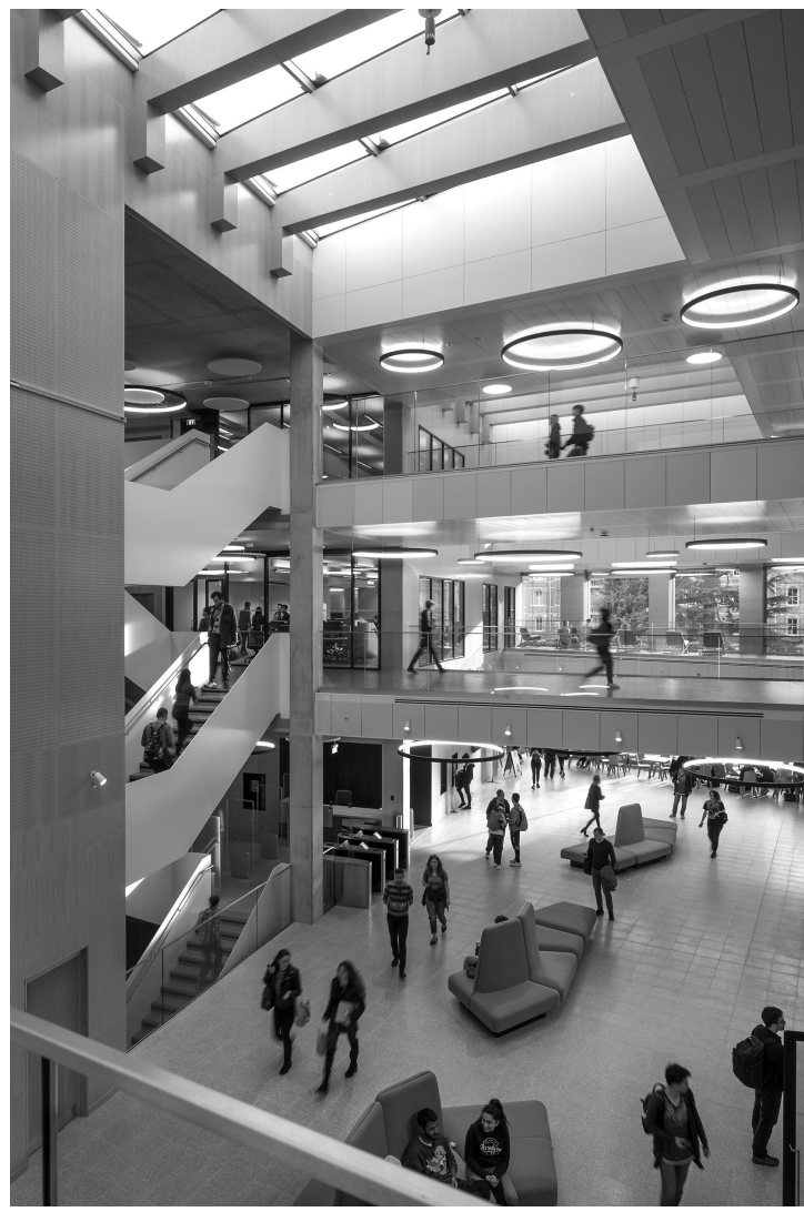
6-7. LH - Retail area at Gatwick South Terminal, Chapman Taylor Architects (1995), Royal Holloway Library, Associated Architects (2018).