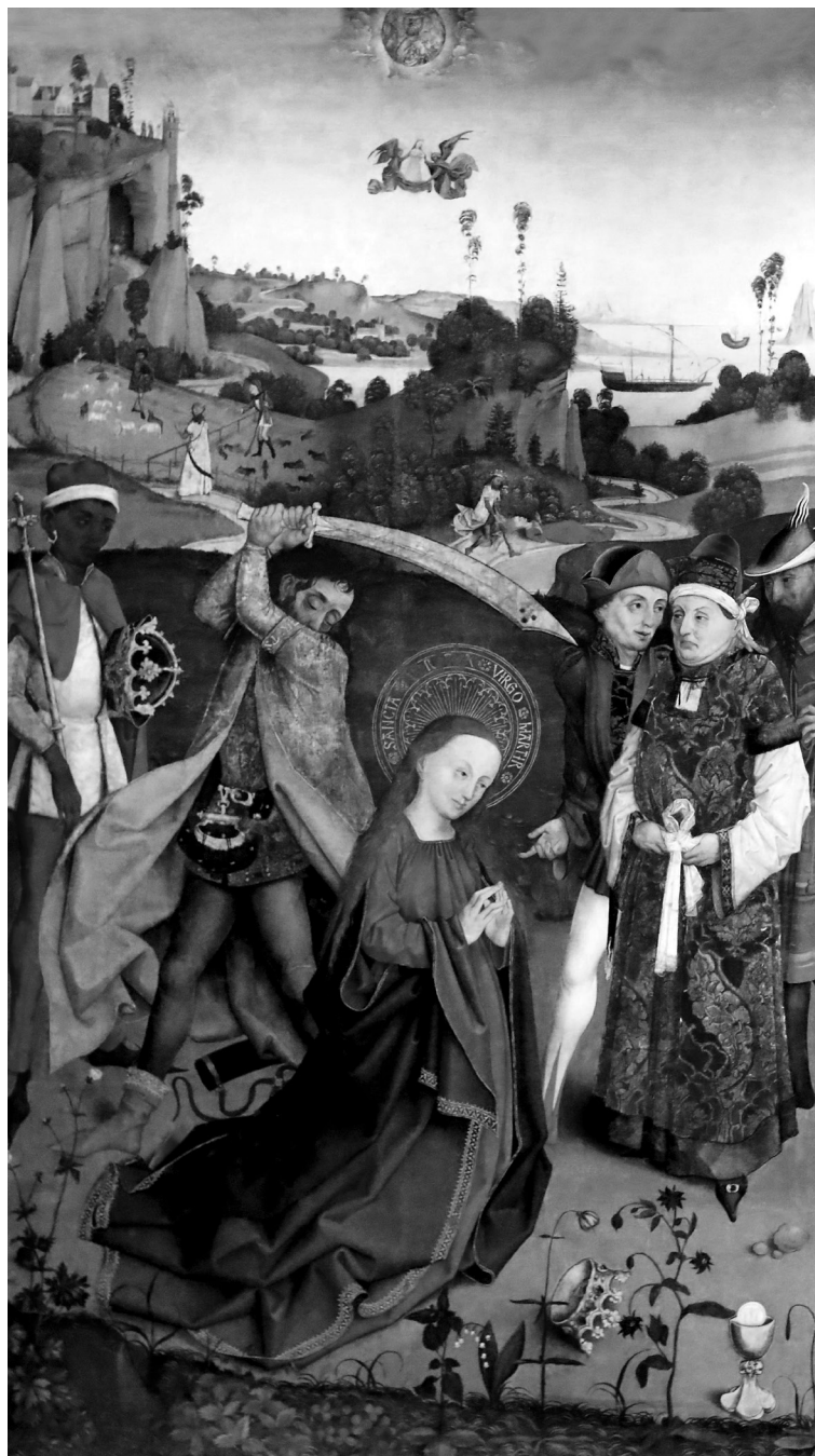
fig. 8 H. Pleydenwurff and his workshop, Martyrdom of St. Barbara, ca. 1465–1470, canvas on panel, 146 × 85.5. National Gallery, Prague.