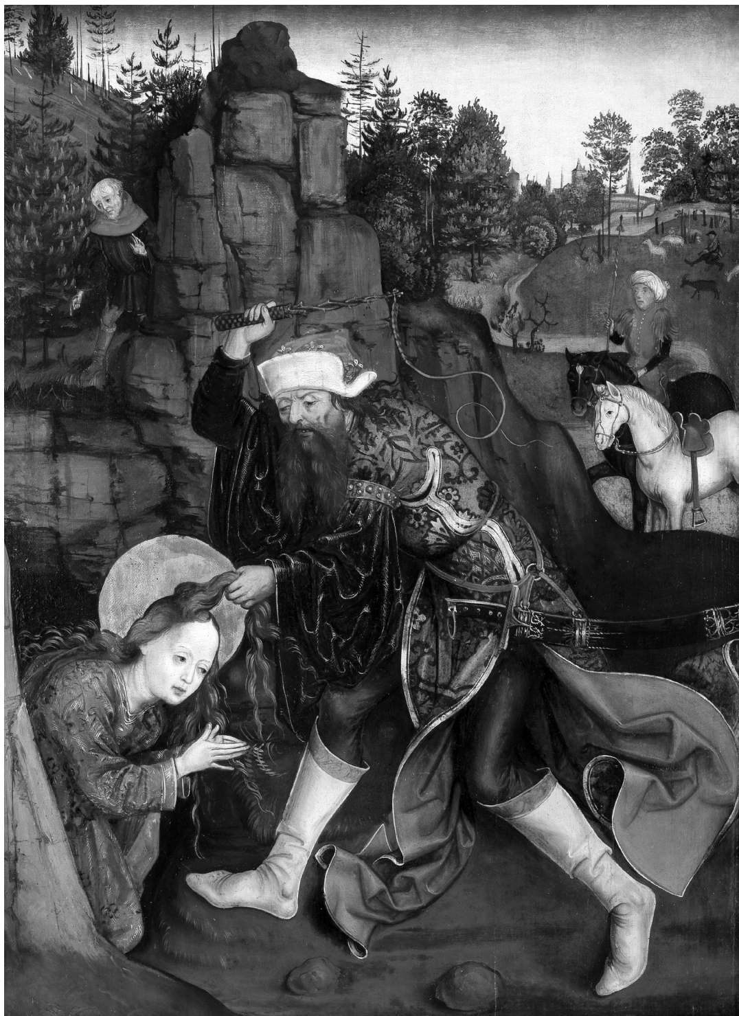
fig. 1 Flagellation of St. Barbara , here attributed to J. Siebenbürger, ca. 1470–1480, panel, 73.6 × 54.6. York Museums Trust: York Art Gallery. Image courtesy of York Museums Trust ( http://yorkmuseumstrust.org.uk [access date: 6 VI 2018]) Public Domain