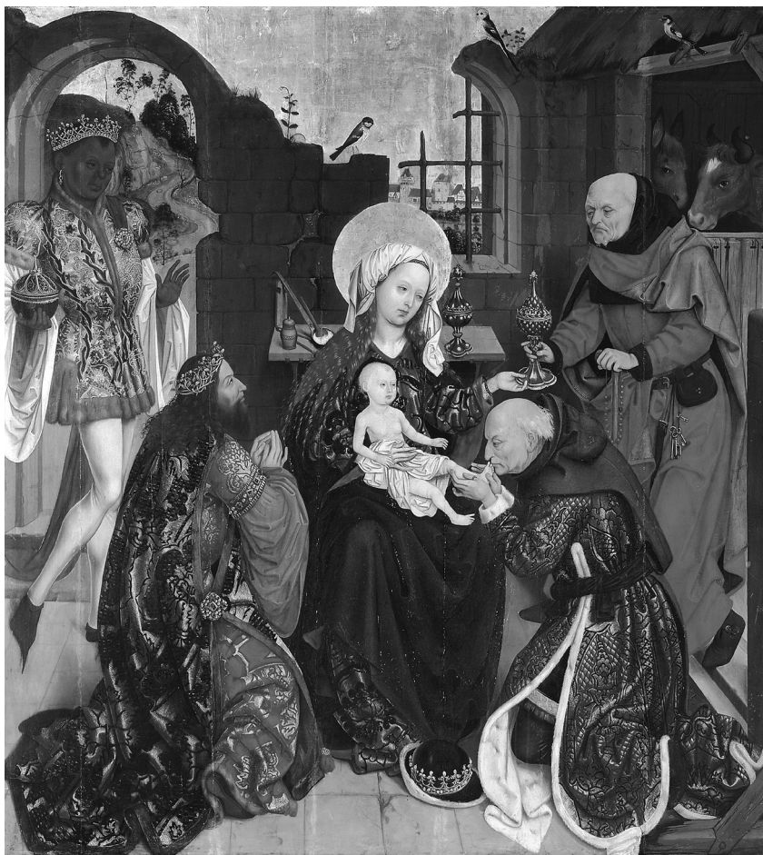
fig. 5 Epiphany from the Schotten Altarpiece, 1469, panel, 86 × 80.

third quarter of the 15 th c.) 23 , or to his workshop (thus dating from the end of 15 th c., or more precisely the 1490s) 24 . I believe that the panels in York Art Gallery and at Upton House can be attributed to Hans Siebenbürger. There are certainly many stylistic similarities between the panels of the St. Barbara Legend and the panels of the Schotten Altarpiece: the faces (both male and female), hands (especially female hands, with outstretched little fingers), folds of the clothes and landscape backgrounds may well have been painted in the same workshop. All the elements are delineated with a gentle and even slightly sketchy contour, and completed with colour in a relatively painterly way. Of course the creation of the Schotten Altarpiece was a major project and undoubtedly many painters in the workshop contributed to it, so even between the depictions of Virgin Mary in its panels we may note some differences. It seems that the head of St. Barbara in the panels under discussion is closest, for example, to