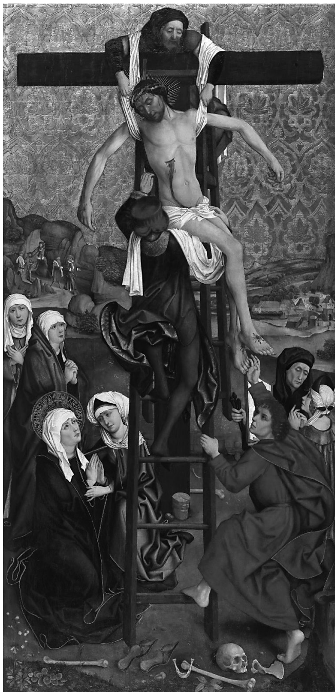
fig. 7 H. Pleydenwurff, Deposition from the high altar for St. Elisabeth Church in Wrocław, 1462, panel, 286.3 × 142.2. Germanisches Nationalmuseum, Nuremberg.