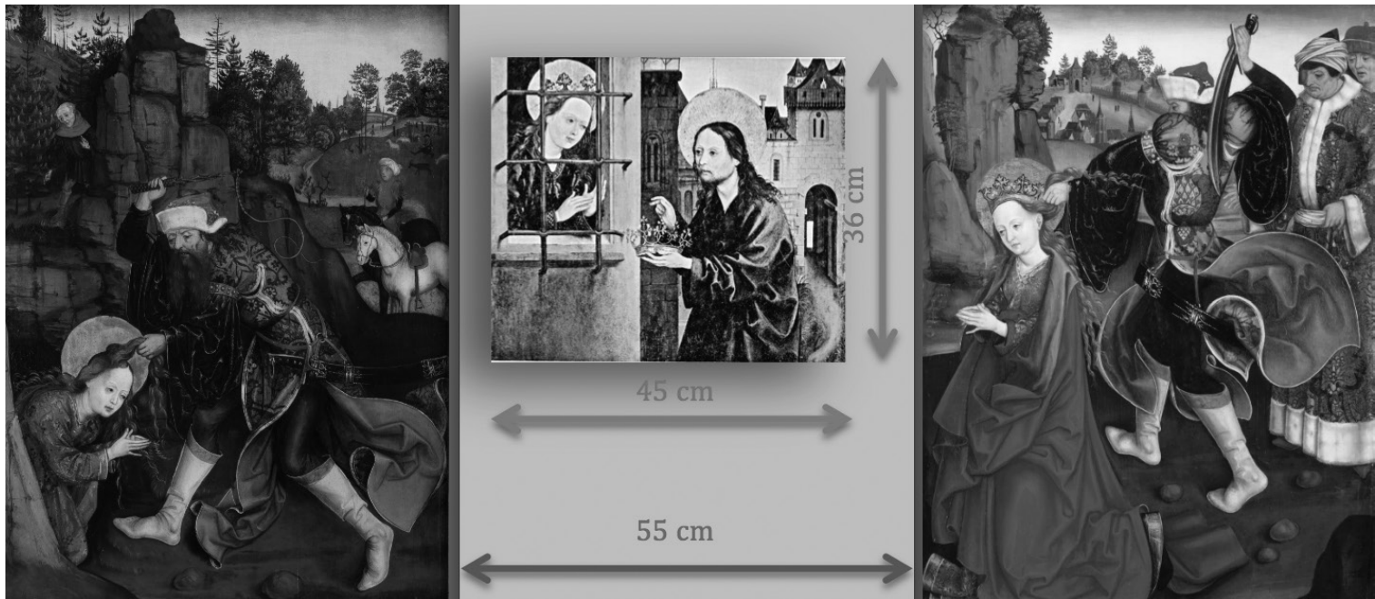
fig. 17 Reconstruction of possible original size of the panel showing Christ Visiting St. Barbara in Prison [fig. 14] in comparison with the panels of Flagellation of St. Barbara [fig. 1] and Martyrdom of St. Barbara [fig. 2]