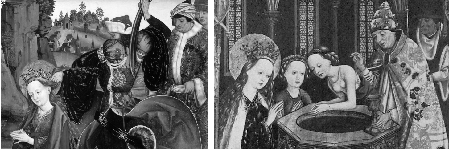
— fig. 13 Comparison of the details of Martyrdom of St. Barbara [fig. 2] and Baptism of the Companions of St. Ursula [fig. 11]