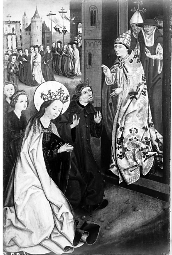
fig. 12 J. Siebenbürger and his workshop, St. Ursula Blessed by the Pope , ca. 1470–1480, panel, 74 × 49. Probably private collection in UK (in 1970 Werther collection in London).