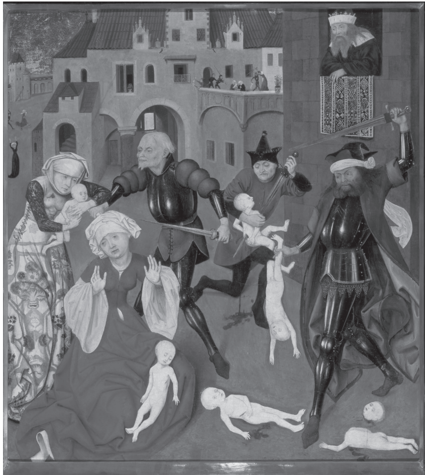
fig. 6 Masacre of the Innocents from the Schotten Altarpiece, 1469, panel, 87 × 80. Schottenstift Museum, Vienna.

25 The altarpiece was struck by lightning in the late 15 th c. and probably partly destroyed; it was replaced in the 17 th c. with a Baroque retable. The only surviving panels are the Deposition , now in the Germanisches Nationalmuseum, Nuremberg (GM1127), and a fragment of the Presentation in the Temple in the National Museum, Warsaw. There were once two other fragments in a public collection in Wrocław ( Crucifixion and Epiphany ) but they have been missing since 1945. See Der frühe Dürer , [exhibition cat.], Hrsg. D. Hess, Th. Eser, Germanisches Nationalmuseum, 24 V – 2 IX 2012, Nuremberg 2012, no. 25.