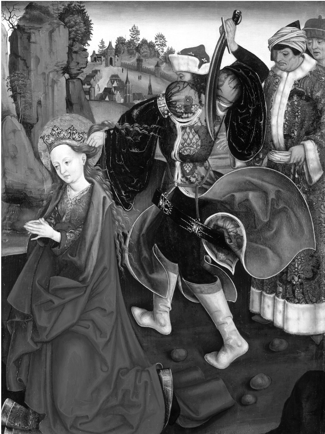
fig. 2 Martyrdom of St. Barbara , here attributed to J. Siebenbürger, ca. 1470–1480, panel, 73 × 54.6. National Trust: Upton House, Warwickshire.