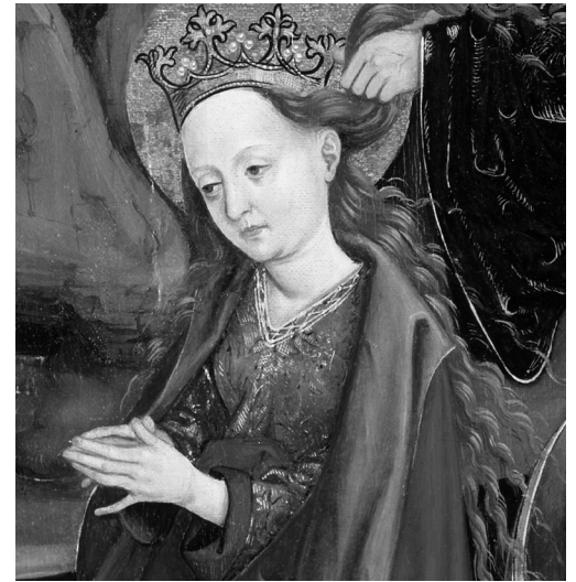
fig. 4 Comparison of the detail from Visitation from the Schotten Altarpiece (1469, panel, 87 × 80. Schottenstift Museum, Vienna) and the details of Martyrdom of St. Barbara [fig. 2] and Flagellation of St. Barbara [fig. 1]