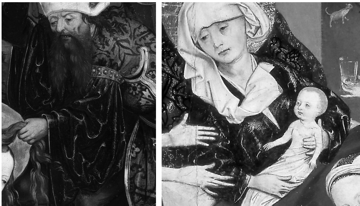
fig. 18 Comparison of the detail of Flagellation of St. Barbara [fig. 1] with the detail from Birth of the Virgin from the Schotten Altarpiece (1469, panel, 87 × 80. Schottenstift Museum, Vienna.)