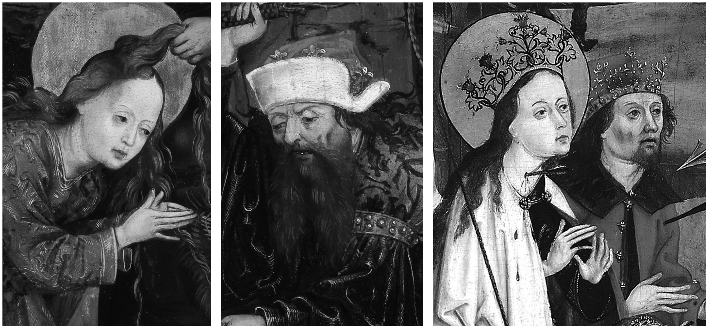
— fig. 14 Comparison of the details of Flagellation of St. Barbara [fig. 1] and Martyrdom of St. Ursula [fig. 10]