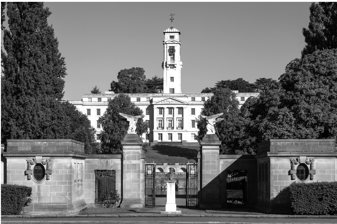
8-9. Clare Hartwell, Nikolaus Pevsner, Elizabeth Williamson, Buildings of England: Nottinghamshire, London 2020, Plate 100: Trent Building, University of Nottingham (1928).