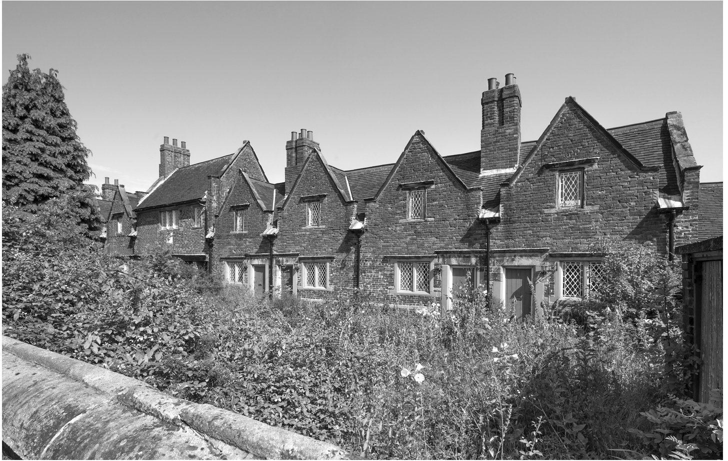
4. Clare Hartwell, Nikolaus Pevsner, Elizabeth Williamson, Buildings of England: Nottinghamshire , London 2020, Plate 62: Willoughby Almshouses (1685).

ately possible to grasp the issue of context as needing to be largely absent. As we have seen in the case of architectural photographs, vehicles, together with people's fashions or signage may date urban pictures especially, as they specifically place a building in time, place and space. From a practical point of view, creating images in such isolationist terms is difficult, and at times almost impossible without the crutch of (thankfully available today) digital manipulation. For me as a practitioner, this raises ethical issues about truth and authenticity for the buildings themselves, where does one draw the line with objectivity and representation in the manner required for this body of photographs?