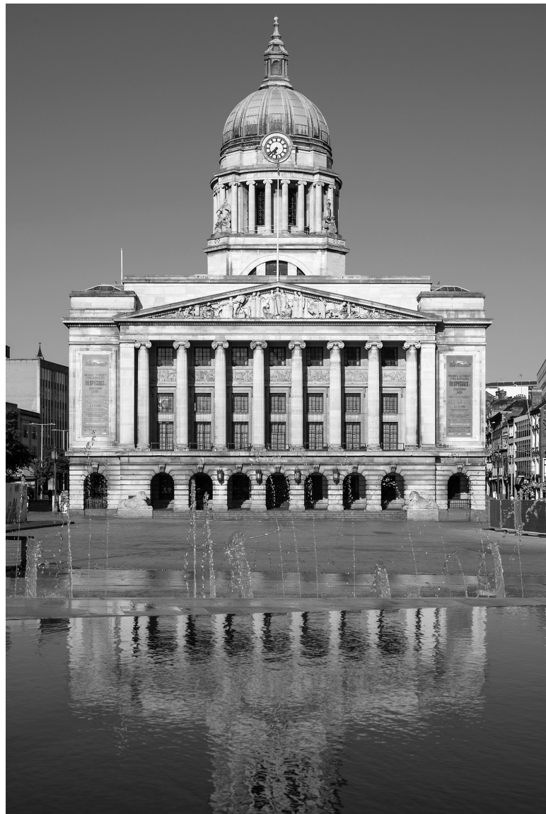
12-13. Clare Hartwell, Nikolaus Pevsner, Elizabeth Williamson, Buildings of England: Nottinghamshire , London 2020, Plate 111: The Council House, Nottingham (1929).