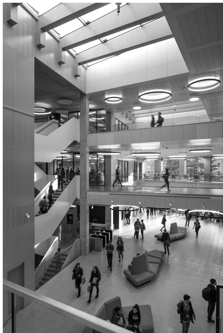
6-7. LH - Retail area at Gatwick South Terminal, Chapman Taylor Architects (1995), Royal Holloway Library, Associated Architects (2018).