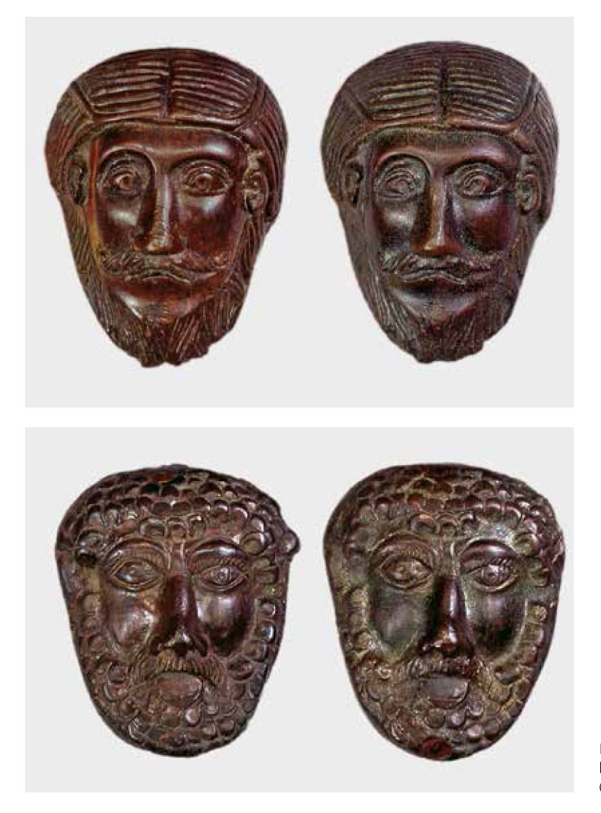
Fig. 1 Bronze heads (top: Kl09 and Kl10; below: Kl11 and Kl12) on the left door leaf.

fingerprint of the individual element composition in their raw materials (Harbottle 1990). Many ancient bronze samples, e.g. old Chinese bronze mirrors, have been analysed by using NAA to understand their production procedures and origins (Li 1981; Gilmore/Ottaway 1980; Nezafatis 2006; Kuleff/ Pernicka 1995; Hölttä/Rodenberg 1987).