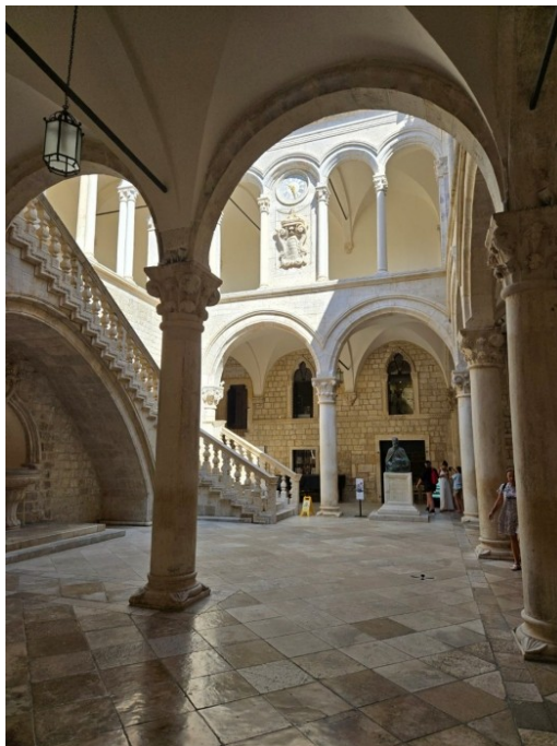
4 Dubrovnik, Rector's Palace, courtyard, renovated by Jeronim Škarpa (Girolamo Scarpa) and Ilija Katičić, ca. 1685–1690

before Napoli's arrival, local masters including Jeronim Škarpa (Girolamo Scarpa, fl. 1685–1693) and Ilija Katičić (1647–1728) had renovated the courtyard porticos by preserving the earlier Gothic-Renaissance forms (Fig. 4).