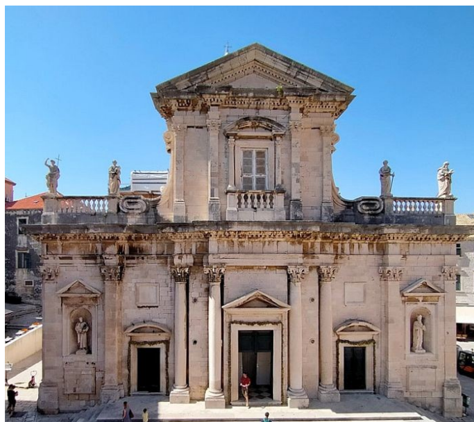
1 Dubrovnik, Cathedral of the Assumption of the Virgin Mary, 1671–1713

architects who oversaw its construction and also contributed to other renovation and rebuilding projects throughout the city.