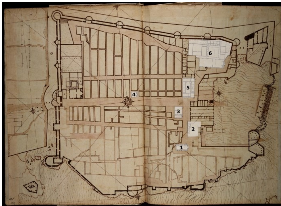
3 Map of Dubrovnik, seventeenth century. Key: 1 Cathedral | 2 Rector's Palace | 3 St Blaise's Church | 4 Petilovrijenci Church | 5 Sponza Palace (Custom House) | 6 Dominican Convent. Archivio di Stato di Torino, Turin, Sezione corte, Biblioteca antica dei Regi archivi, Architettura militare , vol. V, fols. 244v-245r

defined by different agents and manifested through diverse media. 10 By exploring their circulation and interaction, we propose a methodological model for reconstructing architectural knowledge in Dubrovnik during the city's renovation after the earthquake. This paper focuses on a few selected examples: the cathedral, the church of Saint Blaise, the church of Saints Peter, Andrew and Lawrence (also known as Petilovrijenci ), and the Rectors' Palace (Fig. 3).