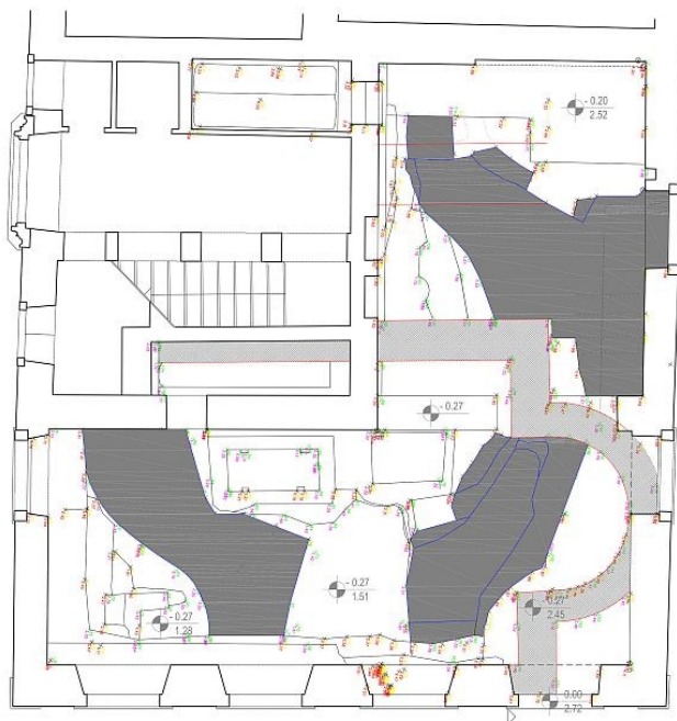
6 Dubrovnik, Petilovrijenci Church, built in 1676, destroyed in 1801, archaeological remains of the foundations (drawing: Zvezdana Tolja)

architectural tradition (Fig. 6). 40 Had this church survived to the present day, it would undoubtedly stand out as a significant instance of Baroque architecture on the eastern Adriatic coast. Unfortunately, the available sources provide little insight into the origins of its central floor plan or the identity of its designer.