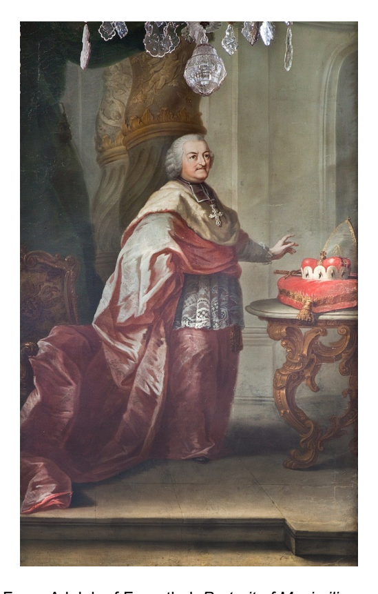
6 Franz Adolph of Freenthal, Portrait of Maximilian von Hamilton , 1769-72. Archiepiscopal Chateau, Kroměříž