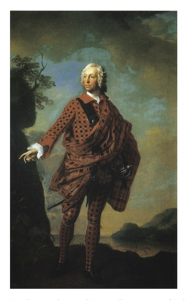
8 Allan Ramsay, Portrait of Norman, Twenty-second Chief of Macleod , 1747. Collection of Macleod of Macleod, Dunvegan Castle, Isle of Skye (reproduction from: Alastair Smart, Allan Ramsay. A complete catalogue of his paintings , New Haven/London 1999, 29)

For it is only in this way that it is possible to explain the meaning of the unusual gesture [14] of the right hand, which is completely lost in the folds of the long train of his episcopal cappa magna. It is this feature that lends the painting a certain dynamism, for the painter emphasised it in his composition through both the attitude of the sitter and the beam of light falling onto it and reflected on it. What is more important, however, is that although in his painting Adolph attired Maximilian Hamilton in clothing that was typical for an official state portrait of a Prince-Bishop of the Holy Roman Empire, he did so in a highly unconventional way. For Hamilton's cappa is not depicted in the way it is normally worn, but the Bishop has it thrown over his shoulder like a toga in antiquity. That this was the intention can be seen from a comparison with a number of portraits by Adolph's British contemporaries. For example, only two years before Adolph's arrival in London (1750) the outstanding British portrait painter Allan Ramsay (1713-1784) used a completely identical, explicitly "classical" approach in depicting the traditional Scottish plaid in which he attired Norman, Twenty-second Chief of Macleod (Collection of Macleod of Macleod, Dunvegan Castle, Isle of Skye). (Fig. 8) With this conceptual approach