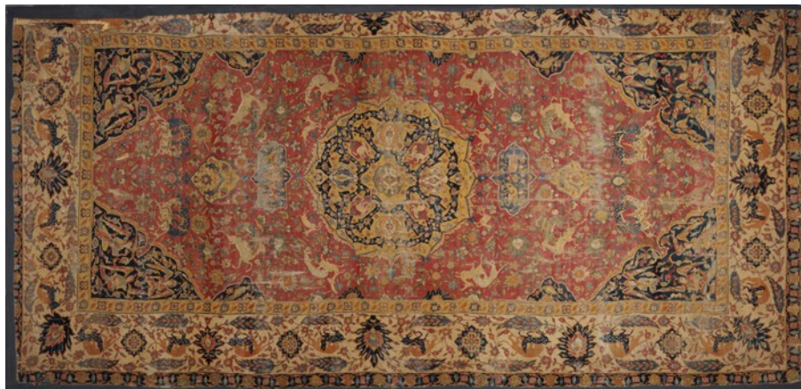
4 Sangusko Carpet, 16th century, wool on cotton and silk, 510.5 x 236cm, Iran, V&A Museum, London, purchased by the South Kensington Museum in 1883 (23-1883).

distinguished extant example of this genre, picked out by Riegl for showing human figures in varied action, "natural growth" rather than stilted symmetry in the vegetal ornament and incorporating Chinese motifs of paired dragons, and phoenixes as well as many "amorphous cloud bands winding their way everywhere in the border." 32