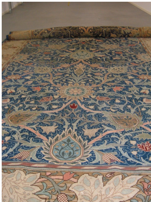
1 William Morris & Co, Clouds , 1885, wool on cotton, 1189 x 396cm, hand-knotted carpet for drawing room at Clouds, East Knoyle, Wiltshire. Collection: University of Cambridge