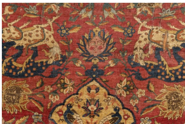
5 As fig. 4 (detail).

[23] The subject matter and stylistic markers separating these kinds of carpets: the mosaic pavement, flowing floral/animal depiction or the representation of human action do not represent a menu for Morris, a range of motifs and schemes that can be selected and combined at will. He states with a shade of disgust that current degenerated carpet design in the east approach the process in just this way, picking randomly between the "disjecta membra". For Morris, in this as in all the arts, the project was to bring the sundered body-parts back together to re-knit or re-knot the elements and restore dynamic force and vitality. This was to put the modern designer back at the nexus of cultural exchange where diverse elements were creatively conjoined as Persian designers were able to do, or even more significantly (because he thought Byzantine design was anterior to sixteenth and seventeenth-century Persian design and all the stronger