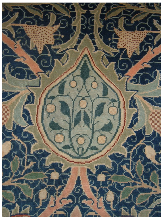
6 As fig. 1 (detail)

we search for explicit correlations to the architecture of the Wyndhams' house: Webb's rectilinear geometrical plasterwork ceiling, and the delicate angular shelving, screen and cabinets of the interior divide a field with junction points but the lines do not correspond to the huge curves of the bold Morris pattern. Morris does not choose to weave in a coded reference to the house by the incorporation of cloud bands as cipher. The pink-buff and dark blue colour scheme of the big carpet known as Clouds is slightly more sky-like than the bold red and blue of the Holland Park design rewoven with only minor muting for its position under the skylight in the hall at Clouds. It is possible to point to those square-ish white tendrils that populate the blue field in Clouds as in most of his large carpet designs; they are sufficiently random in relation to the dominant geometry of the design to suggest the energetic rolling, knotting and stretching of life-force invested cloud bands (fig. 6). But in establishing the meaning of the design we miss the point if we understand architecture just in terms of building elements, and meaning just in terms of a hidden code.