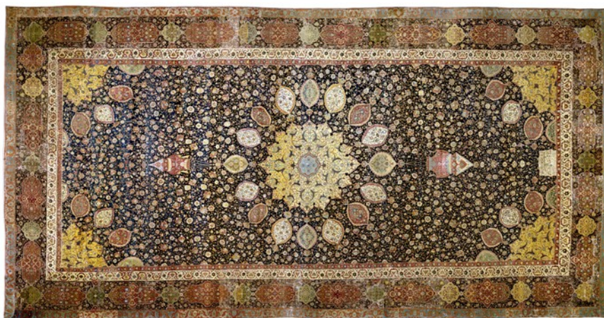
3 Ardabil Carpet, 1539-1540, wool on silk, 1051.5 x 533.5cm, Iran, V&A Museum, London, purchased by the South Kensington Museum in 1893 (272-1893).