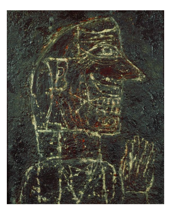
6 Jean Dubuffet, Profil genre aztèque (Aztec type profile), November 1945, oil on canvas, 65 x 54 cm. Private collection