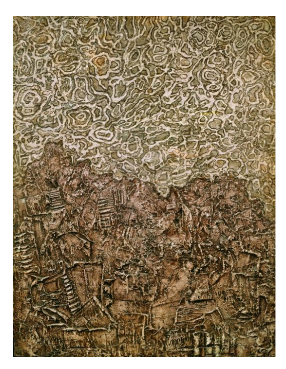
7 Jean Dubuffet, Extase au ciel (Ecstasy in the sky), July 1952, oil on Isorel/Masonite board, 115 x 88 cm. Private collection

[33] In another instance, Matisse alerted Dubuffet to a painting that "is peeling off in a horrifying way":