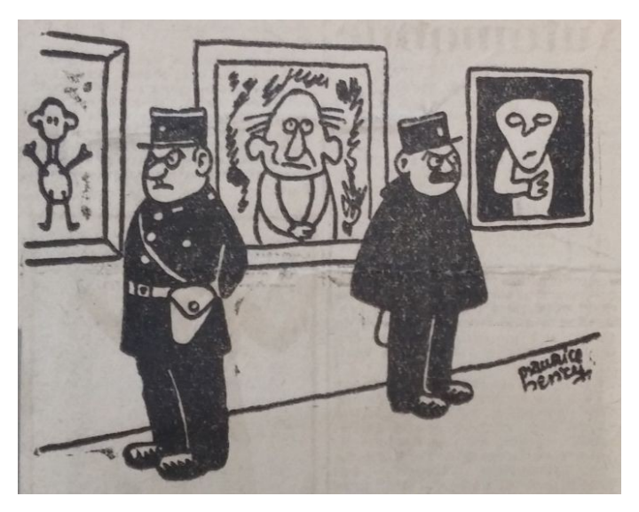
9 Maurice Henry, illustration for Justin Saget, "Léautaud", in: Combat (24 October 1947), in: Archives Fondation Dubuffet, Jean Dubuffet, "Coupures de presse", no. 3, 1947

guard separates the adversaries with his unflappable calm". <sup>107</sup> The journal Juin alerted its readers that "[a] man, seated on a sort of throne, has taken on the defense of Dubuffet's canvases against the zeal of the iconoclasts. He is armed with a big revolver. <sup>108</sup> Pierre Descargues similarly reported that a stern armed watchman was safeguarding the gallery's artistic and commercial investments: "A guard, with a fierce countenance, has been stationed, armed with a revolver, to protect these artistic and commercial interests. <sup>109</sup> A year later, a caricature by illustrator Maurice Henry ran in Combat depicting two gruff uniformed policemen, gun in holster, guarding Dubuffet's self-destructing paintings from further attacks (Fig. 9). <sup>110</sup>