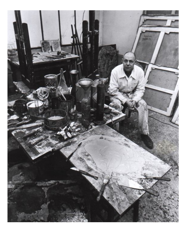
1 Jean Dubuffet in his studio, rue de Rennes, 1951 (photograph © Robert Doisneau / Gamma-Rapho; © VG Bild-Kunst 2019)

[7] These "messes" and "problems" varied from inconsequential glitches to serious casualties, and the pages of Dubuffet's correspondence detail these incidents with alarm and amusement. In one notable instance, a portrait by Dubuffet that Paulhan had mounted over his mantel became welded to the wall due to the heat of the fireplace, with the cement and tar in the painting adhering inextricably to the wall. Paulhan was supposedly proud of this "peinture attachante", using a word that means both "attached to" (by an adhesive) and "endearing, engaging and charming". 16