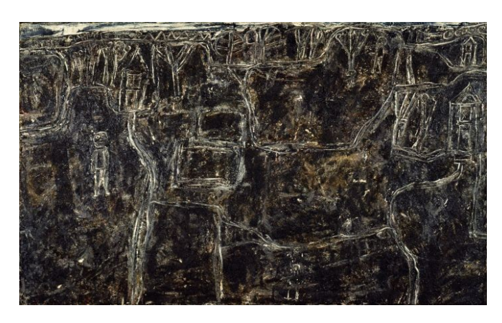
4 Jean Dubuffet, Paysage charbonneux (Sooty landscape), May-June 1946, Haute pâte on canvas or board, 97 x 162 cm. Private collection

the narrowest sliver of sky on the upper left, as the thickly textured ground completely takes over (Fig. 4).