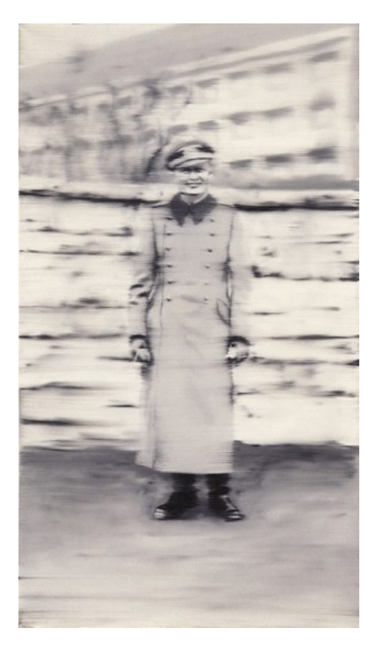
2 Gerhard Richter, Onkel Rudi , 1965, oil on canvas (© Gerhard Richter 2014)

between the initial photographic image an the artist's contemporary reception, the image of the past coming back as a spectre; as a faded or not always readable after-image. Painting is then a dialectical practice of remembering and forgetting, of seeing and short-sightedness: the come back of photography on canvas shows traces of a difficult road it had covered. The smile of uncle Rudi ( Onkel Rudi , 1965, fig. 2) – seen on the portrait of the artist's family member in Wehrmacht uniform – seems as inadequate as the smiles of Libera's staged prisoners of history – and memory. This family smile seems out-of-place due to the series of displacements and conflicts of several contradictory memories – especially the individual memory of the artist and his family relation with the portrayed man and the collective coding of the Nazi uniform as a signifiant of maleficent history. The lack of sharpness of the image stems from this very conflict, from the traumatic clash of memory and history inscribed in it.