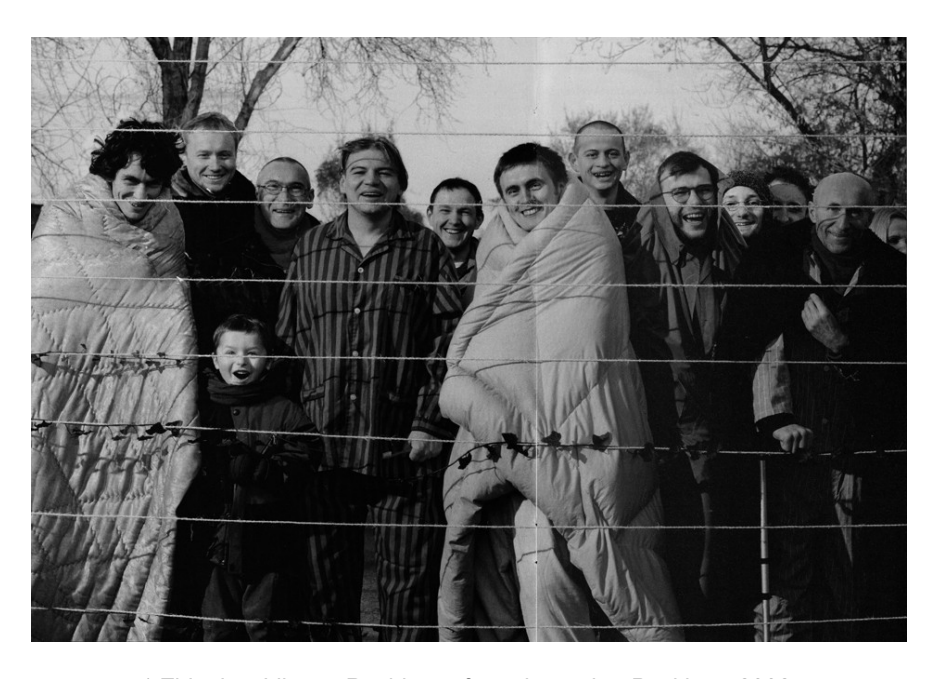
1 Zbigniew Libera, Residents , from the series Positives , 2002, photograph

living picture that becomes alive after the live of the "original". In other words, Libera does not create new images, but he visualises the layers of time and the meaning-related, reception-based virtual changeability of these photographs dependent on the mechanisms of memory<sup>23</sup>. Positives is a result of a contemporary and past looking, an image of displacements and repetitions petrified in one form. This work requires recognition, that is the merging of the perceived and remembered image, for the viewer is presented with a preparation of the process of complex memory constructed by the artist. Although most of all it concerns collective memory, the effectiveness of it, based on recognition indeed, depends on individual erudition and may be different depending on the viewer.