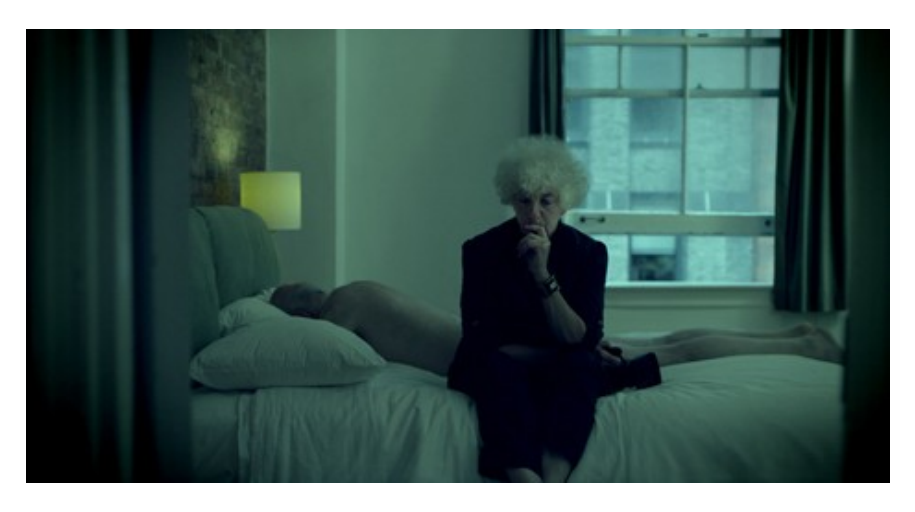
9 Izabella Gustowska, The Case of Josephine H. , 2014, film still

[17] In April 2014 Gustowska finished a project titled The Case of Josephine H. , with references to The Strings of Time , yet autonomous from it, a forty-seven-minute-long film, which concentrates on Hopper's wife (fig. 8, fig. 9). If previous works were a form of the contemporary reception of the painting of the American artist, this one constitutes –