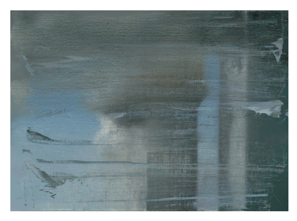
4 Gerhard Richter, September, 2005, oil on canvas (© Gerhard Richter 2014)