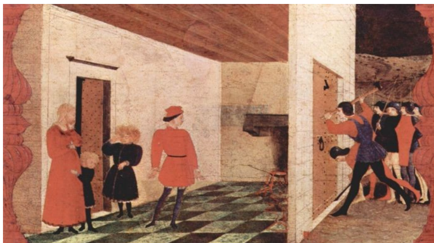
2 Paolo Uccello, The Miracle of the Desecrated Host , 1467–1469, a six-part predella cycle, tempera on wood, 42 × 341 cm, detail: second panel, 42 x 58 cm. Galleria Nazionale delle Marche, Urbino