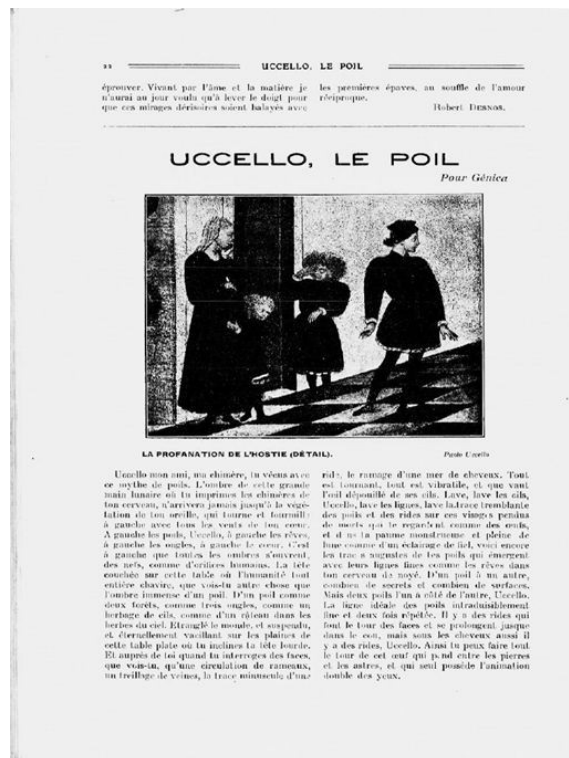
1 Antonin Artaud, "Uccello, le Poil", in: La Révolution surréaliste 8 (1926), 22, with a reproduction of a detail from Paolo Uccello's predella cycle on The Miracle of the Desecrated Host (as Fig. 2) (reprod. from: André Breton et al., La Révolution surréaliste: 1924–1929 [complete facsimile edition of original twelve issues], Paris 1975, 22)