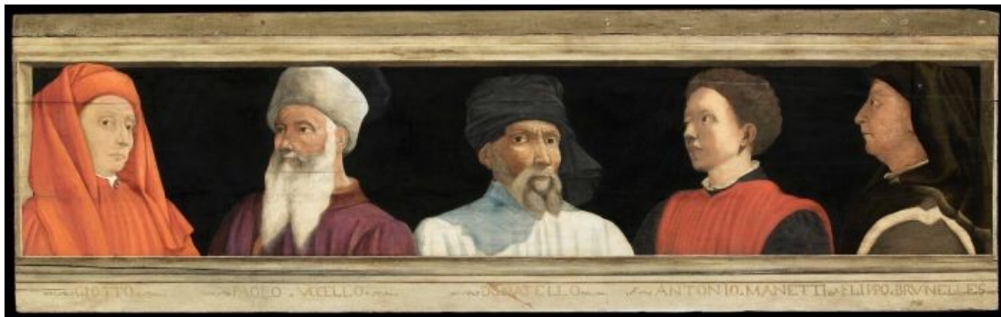
4 Artist unknown, Cinq maîtres de la Renaissance florentine: Giotto, Uccello, Donatello, Manetti, Brunelleschi , ca. 1500–1550, oil on wood, 66 x 210 cm. Musée du Louvre, Paris

[21] "Uccello, le Poil" is a complex text sometimes qualified as a painting-poem , painting a picture through words. 59 It appears to discuss, among other things, an unnamed work of art, which is not the second panel of Uccello's predella The Miracle of the Desecrated Host . Some scholars consider the discussed work to be a complete invention of Artaud. In my view, however, it is quite clear that Artaud refers to an existing work, 60 and identifying it will not only provide insight into some of the text's more enigmatic phrases but also show what kind of image of Uccello Artaud (and others) may have had in mind. I propose the portrait that Uccello allegedly painted of himself, alongside that of four other Florentine Renaissance masters. This panel is now known as Cinq maîtres de la Renaissance florentine (ca. 1500–1550) and sometimes Five Famous Men (The Fathers of Perspective) , attributed to an unknown master of the Florentine school (Fig. 4). 61