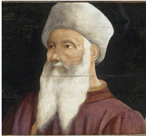
5 Artist unknown, Cinq maîtres de la Renaissance florentine, ca. 1500–1550, oil on wood, 66 x 210 cm, detail of Uccello. Musée du Louvre, Paris

address and construct the author himself, it seems quite apt that the hair-reverie in "Uccello, le Poil" was primarily inspired by Uccello's "self"-portrait. Also, there is the matter of an additional, hidden hypotext for Artaud's Uccellan writings: the essay "L'Art" by Marcel Schwob, containing a dialogue between the Dutch Golden Age painter Jan van Scorel and several Italian masters, including Uccello. 65 In it, the character Uccello specifically mentions one work by his own hand: a "tableau oblong" upon which he has painted the portraits of men who "have recreated the universe", including himself. This is, in other words, the Louvre panel. 66