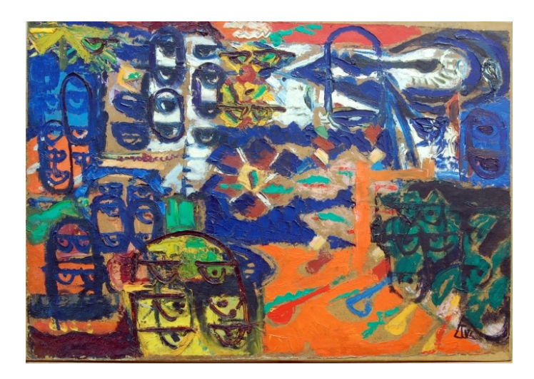
3 Ion Ţuculescu (1910–1962), Composition (with Folk Art Objects) , undated, oil on canvas, 49 × 70 cm. Muzeul Național de Artă al României, Bucharest, 87.270/1424