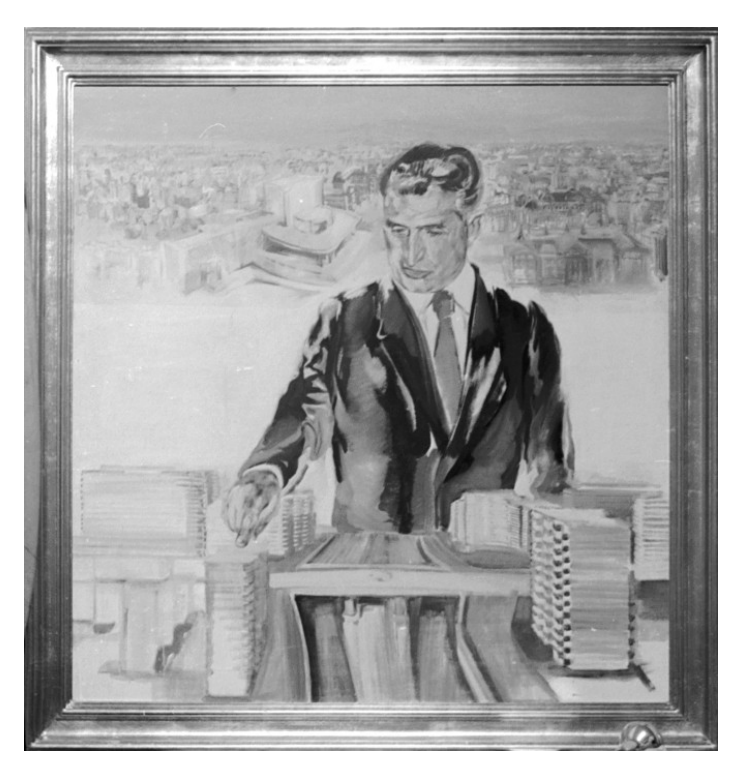
2 Ion Grigorescu, The Portrait of President Ceauşescu Alone , 1980, oil on canvas, 100 × 100 cm. Destroyed by the artist