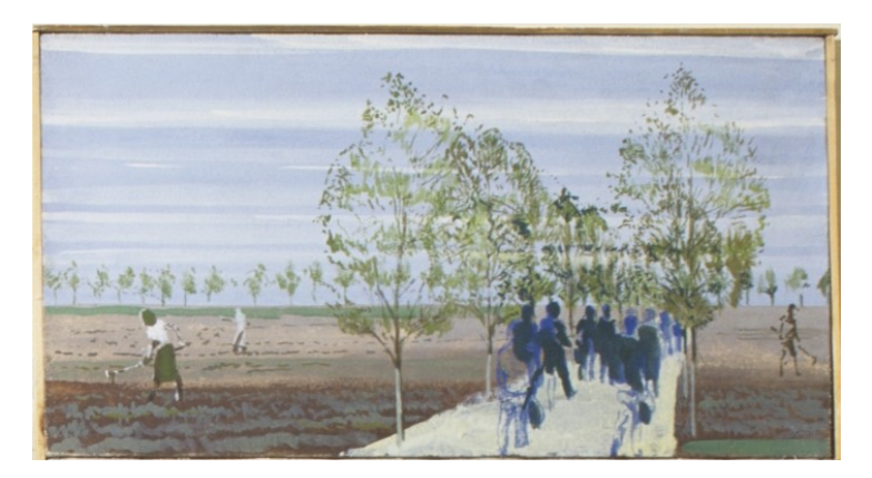
9 Ion Grigorescu, Reporting from Gorj (Heading for the City) , 1972, oil on canvas, 38,5 × 73 cm

[14] Grigorescu emphasises the isolation and poverty in the countryside by including in Reporting from Gorj two scenes which are foreign to rural life. One, a collective portrait, shows a group he calls "the village intellectuals" whose features are recognisable (Fig. 10), in contrast to a row of peasants with indistinguishable faces in the fields (Fig. 4). Unlike these muted pictures, the other depicts a garden of lush vegetation in which a couple are lounging after a meal, indicated by an abundance of coffee cups and bottles of wine and brandy (Fig. 11).