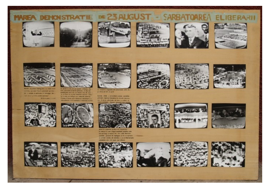
14 Ion Grigorescu, The Great Demonstration of August 23 , 1974, photographs on plywood, 88 \times 133 cm

called "Art and History" organised by the Visual Artists' Union. Grigorescu sourced these images in the official broadcast of the demonstrations. He took pictures of his television screen. Similarly, the text he added under some photographs came from the official account of the event, as they are excerpts from Ceauşescu's National Day address which had been published in the Scînteia newspaper. According to the artist, he did not alter the images and texts before using them in the collage; they were included "as they were".