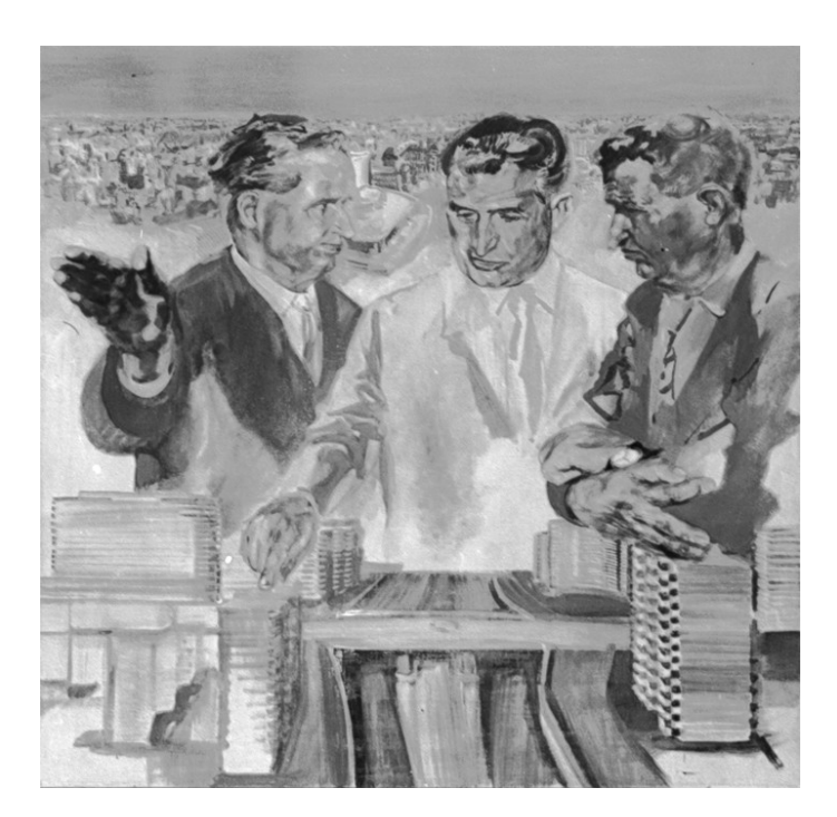
1 Ion Grigorescu, The Triple Portrait of the President Nicolae Ceauşescu , 1980, oil on canvas, 100 × 100 cm. Destroyed by the artist