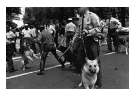
3b "The Spectacle of Racial Turbulence in Birmingham: They Fight a Fire that Won't Go Out," Life , May 17, 1963, 30.

On a two-page spread (fig. 3a,b) that displays a sequence of three photographs illustrating a well-dressed black man mauled by a lunging police dog, Life explained that: