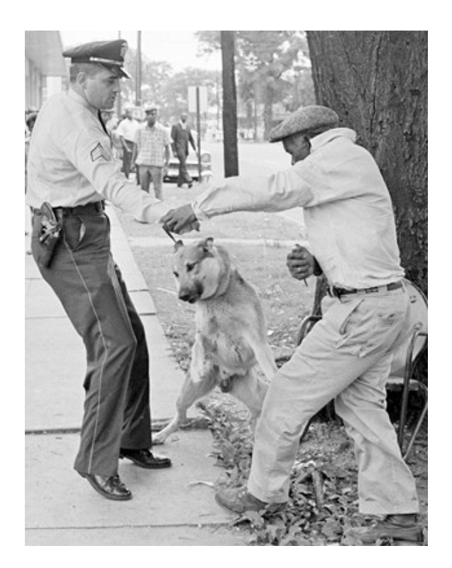
5 Bill Hudson, Man with Knife Attempting to Stab Police Dog, Birmingham, Alabama, May 3, 1963

[15] Before the rise of the Nation of Islam and the Black Panthers in the second half of the 1960s complicated how Americans understood depictions of black power, black publications consistently provided images and text that highlighted the agency of protestors. Articles in the black press focused on the physical opposition of blacks to arbitrary white power; they understood the exercise of black power as both a means to attain racial equality and as an end in its own right. In contrast, liberal whites imagined that pictures of "passive" blacks could best encourage white support for granting blacks greater social and political power.