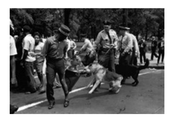
3a "The Spectacle of Racial Turbulence in Birmingham: They Fight a Fire that Won't Go Out," Life , May 17, 1963, 30. Reproduced from: Michael S. Durham, Powerfull days. The civil rights photography of Charles Moore , New York 1991, 104

demonstrations stand today as visual shorthand for the civil rights movement, and are consequently reproduced with little explanatory text. In the first blush of the conflict, when their meanings were still in flux, Life reproduced the photographs with copious descriptive copy.