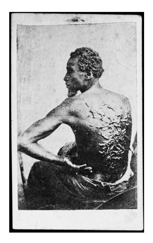
6 McAllister & Brothers, The Scourged Back , carte-devisite, 1863. Albumen silver carte-de-visite, 10 x 7 cm.

McAllister & Brothers and ultimately reproduced in a wood-block engraving in Harper's Weekly for that magazine's Independence Day issue in 1863.