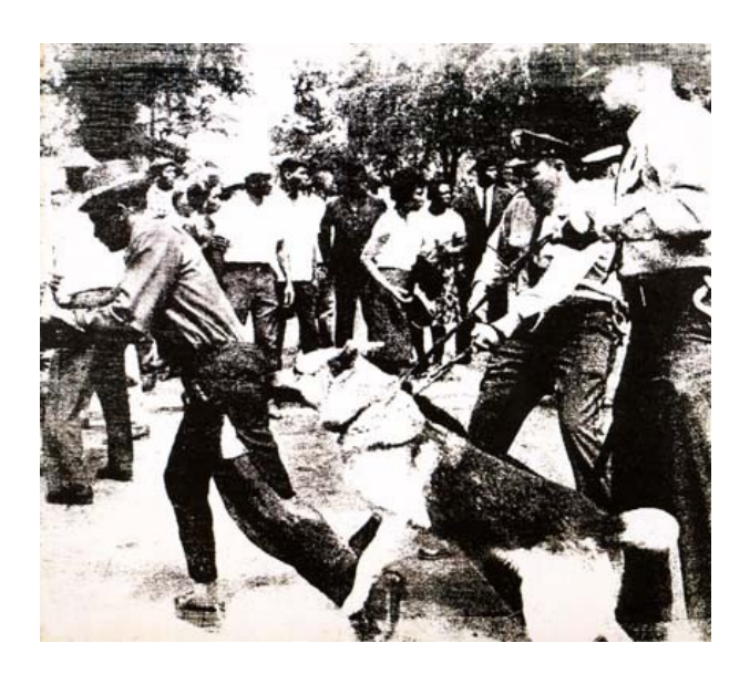
4 Andy Warhol, Little white riot , 1964, Acrylic and silkscreen ink on canvas, 76 x 84 cm. Reproduced from: Andy Warhol. Death and Disasters , exh.cat., Houston 1988, 97, fig. 29

photographs that too obviously illustrated active blacks and inactive whites held scant allure.<sup>17</sup>