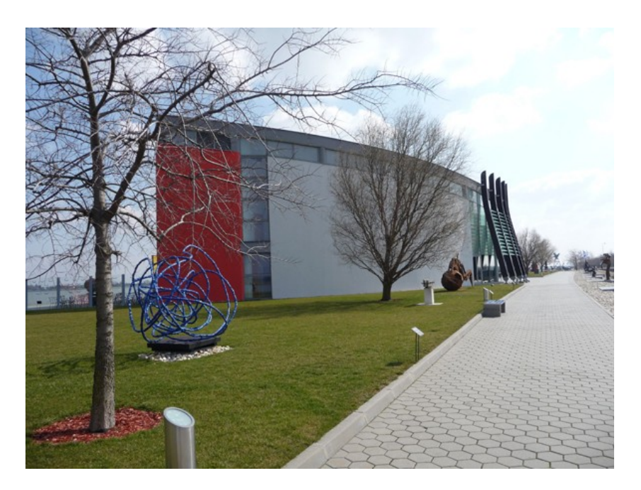
19 Danubiana Meulensteen Art Museum near Bratislava

space, but a fenced museum zone, accessible only with a ticket). A café spills out into the space of the garden, which also merges with the exhibition rooms in mutual permeation: the sculptures can be viewed from the glazed parts of the ground floor (and those strolling in the garden can take a look at the works displayed inside the museum) while the observation deck on the upper floor offers a picturesque panorama of the river.