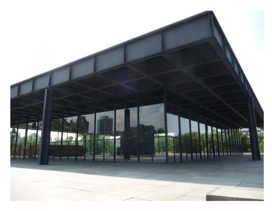
6 Neue Nationalgalerie in Berlin