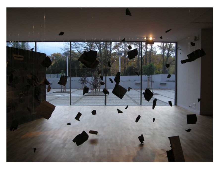
9 Znaki Czasu ('Signs of the Time') Centre of Contemporary Art in Torun, view of the adjacent square seen from the exhibition room