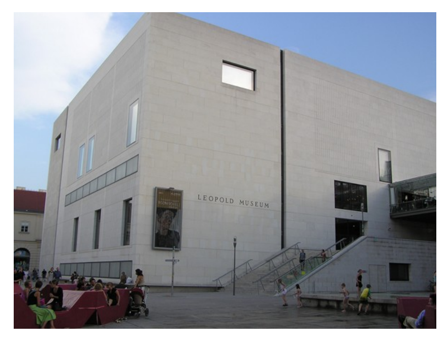
17 Leopold Museum in Vienna

Moderner Kunst Stiftung Ludwig Wien and Leopold Museum). The courtyard has an organizational function for all the cultural institutions around it. It has been redefined as a recreation ground, with a fountain and benches, and a venue for events, such as fashion, design or dance shows, a literary festival, DJs' performances, programmes for children, etc. It is one of the favourite meeting places for the people of Vienna. The benches themselves are works of art (designed by PPAG Architects: Anna Sopelka and Georg Poduschka), and have become one of the most recognizable features of this part of the city. Their colour is changed every year, which causes the space of the courtyard to be redefined on an ongoing basis.<sup>16</sup>