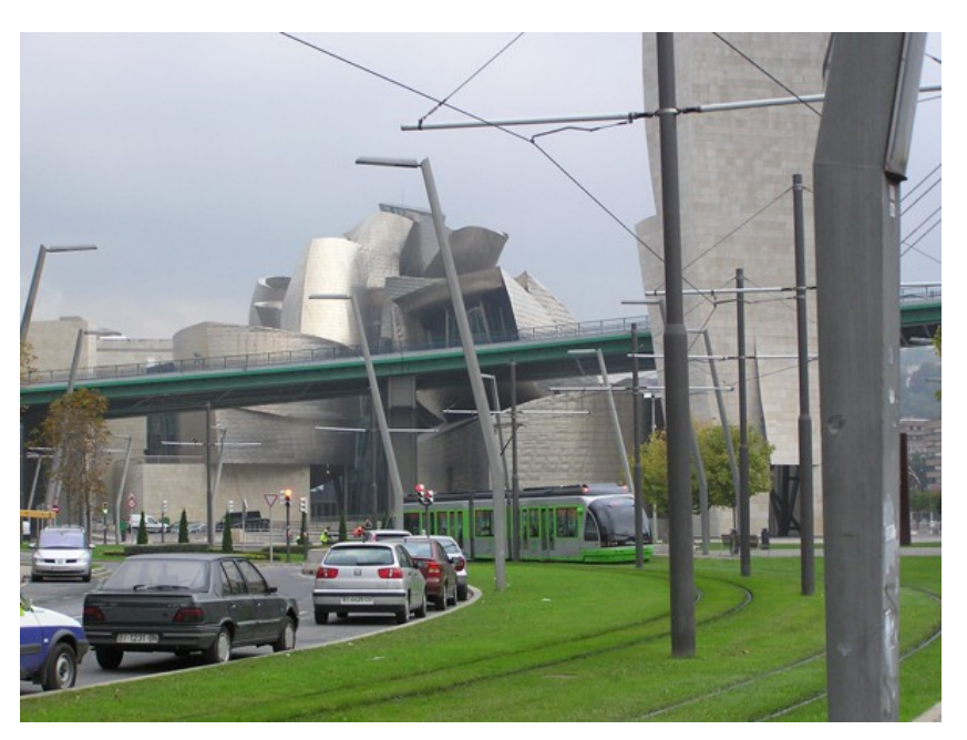
22 Guggenheim Museum Bilbao

[19] These and similar questions appear to be an immanent part of the ongoing development of museums of (not only contemporary) art, which are attaching increasing weight to educational activities and broadly defined entertainment. Some time ago, when writing about museums operating in cultural districts, e.g. the MQ in Vienna, I observed that "cultural districts are a kind of multiplexes targeting audiences of varied needs. To use extreme language, they could be described as Disneylands of culture, with a number of attractions awaiting the visitor in individualized buildings and separate designated spaces. The principal idea is that of entertainment: ranging from ludic to sophisticated