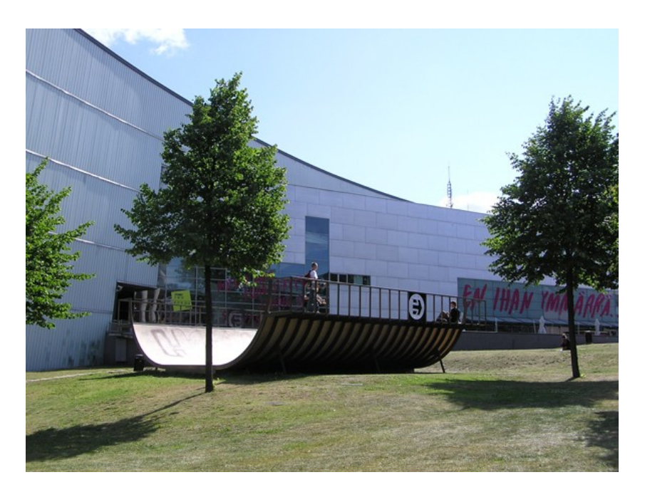
18 Kiasma Museum of Contemporary Art in Helsinki, skateboarding ramp

a café, a shop, a reading corner and a room mostly used by school children, with information technology which is free to use. We have a theatre and a place called 'rear window', where we show small exhibitions based on suggestions we get from outside from children, different social groups, photographers, campaign organisers against AIDS or drugs and so on. It's like a 'Speakers' Corner' wall and it has worked very well. On the ground floor we have almost forty per cent more visitors than the official records show. Kiasma has become a real crossing point."<sup>18</sup> In summertime, café tables are put out onto the square surrounding the museum, and sculptures just outside the entrance, in addition to bicycle stands; a skateboarding ramp is also set up on the lawn along the glazed façade. The building is made up of two interwoven structures: a longer one, pronouncedly curved and encompassing the lower one, which is rectangular. The two shorter façades are almost entirely filled with windows, and the western, perpendicular wall is also glazed. Looking at the streets from the exhibition rooms – through the windows and from the observation deck – is an inseparable feature of a visit to the Helsinki museum.