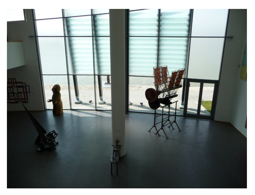
20 Danubiana Meulensteen Art Museum near Bratislava, view of the interior with windows overlooking a panoramic vista of the Danube

[17] Some museum buildings seem to turn their back on the street deliberately. Their interiors are not visible from the outside, and people who are inside remain in a closed world of