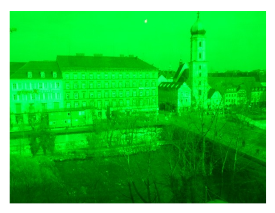
15 Kunsthaus Graz, view of the old town seen from the observation deck