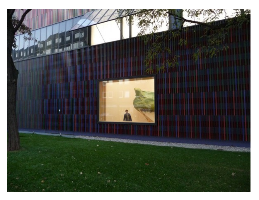
16 Museum Brandhorst in Munich, view of the glazed ground floor

[14] The simplest ploy (requiring no structural modification) to overcome the barrier between the interior and the exterior of an institution seems to be to place certain objects outside the building: café tables, benches, sculptures or installations, and in this way to build an external entrance space around the door. A most elaborate strategy for full utilization of public space is represented by the MuseumsQuartier in Vienna (fig. 17, 21) – a conglomerate of ten cultural institutions, including two art museums and a Kunsthalle . The institutions are located on the site of the 18<sup>th</sup>-century imperial stables; two large museums were built from scratch in the courtyard of a historic complex (MUMOK Museum