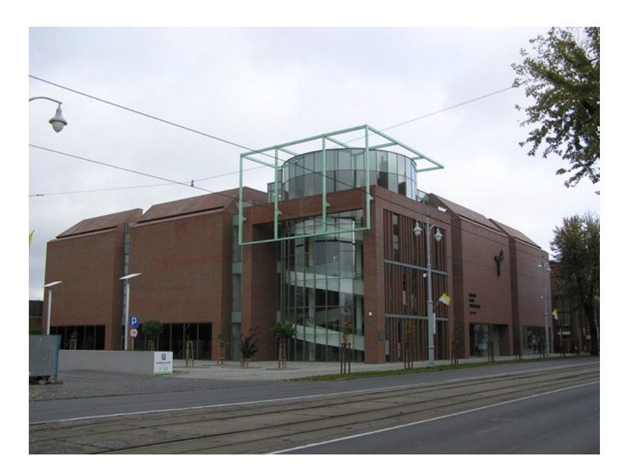
8 Znaki Czasu ('Signs of the Time') Centre of Contemporary Art in Torun