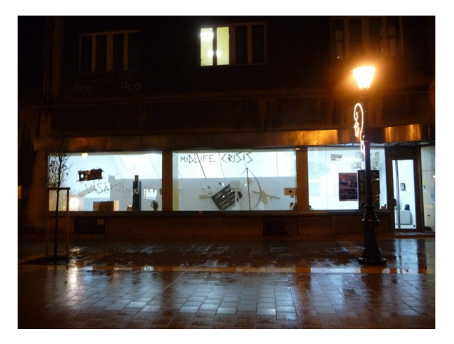
7 Dorottya Gallery in Budapest