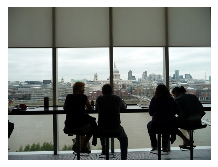
13 Tate Modern in London, view from the café

opened in 2009 in Munich (fig. 16), or the older Leopold Museum in Vienna (Ortner & Ortner, 2001).