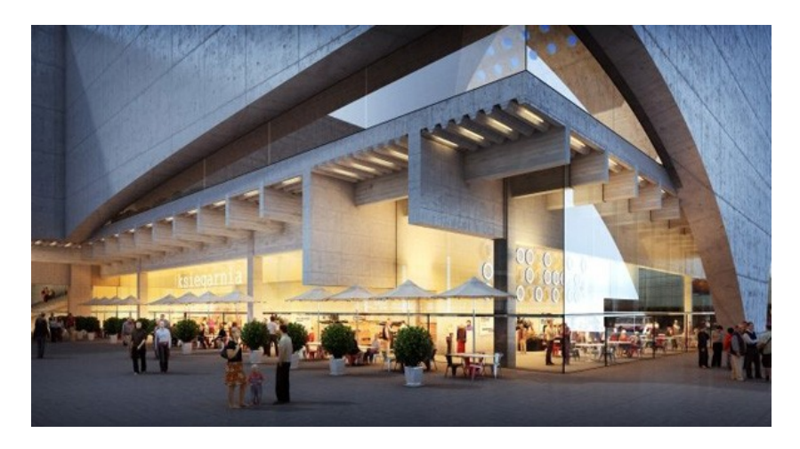
5 Museum of Modern Art in Warsaw, design, view of the ground floor

urban square and park will determine the Museum's openness to the space of the City."<sup>3</sup> One of the competition requirements was that the ground floor of the building (described as a "public meetings zone") was to include a café and a restaurant with seasonal outdoor sections and some room for activities in the "public space of the city" (community art project), accessible from outside the building only, while what was called the exhibition space, amounting to some 10,000 m<sup>2</sup>, should contain – in addition to display rooms – "rest zones, observation decks strewn all over the Museum, external and internal views."<sup>4</sup>