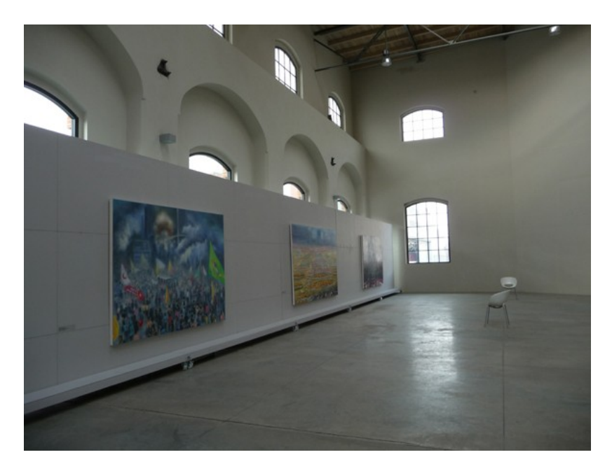
12 Wannieck Gallery in Brno, view of the interior