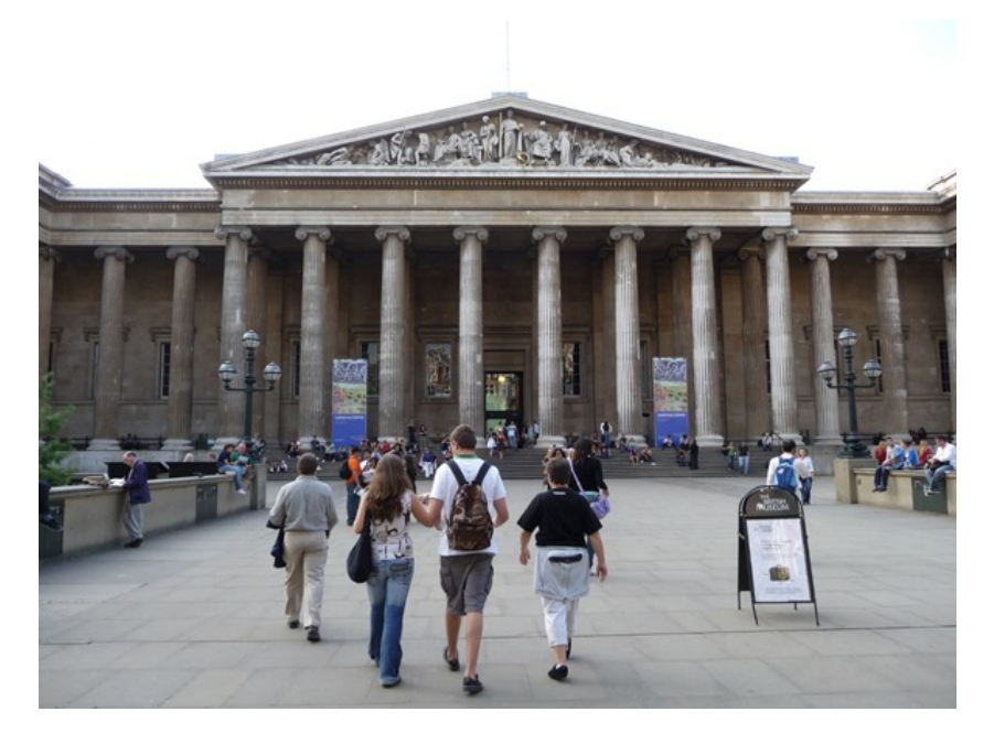
1 British Museum in London

of the museum in this building designed by Frank Lloyd Wright in 1959, unconventional museum facilities were created for contemporary art with growing frequency, at places more and more distant from the major centres of culture, and architects made sure that their designs were increasingly elaborate and inventive.