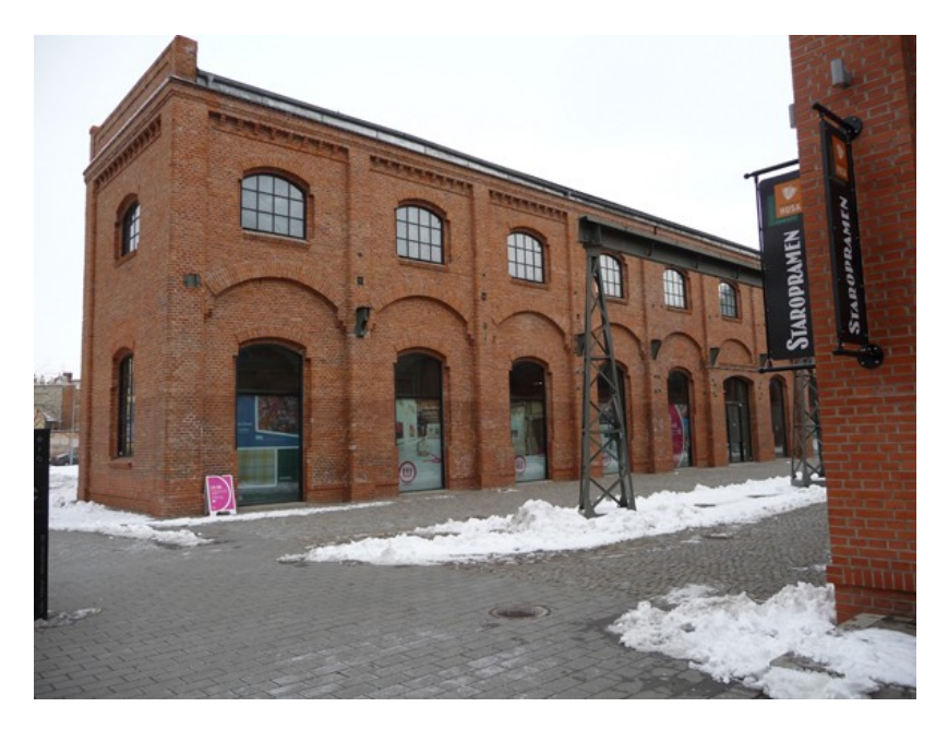
11 Wannieck Gallery in Brno

[12] Not all institutions use the existing opportunities to make this type of contact with the passer-by/viewer despite the fact that, in some cases, the structural qualities of their buildings are more than conducive to it. The Wannieck Gallery (Antonín Novák, 2006), located in the adapted building of the 19<sup>th</sup>-century Vaňkovka factory in Brno, used its interior arrangement to turn its back on the inner street of the factory complex that divided it from a shopping centre (fig. 11, 12). As in the case of Temporary Contemporary, the entrance takes you directly into the exhibition room, except that here the row of windows filling the long façade of the brick building has been screened with a division wall, with paintings hung only on the side facing the interior. Consequently, the exhibition space is not visible from the outside.