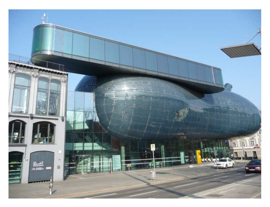
14 Kunsthaus Graz