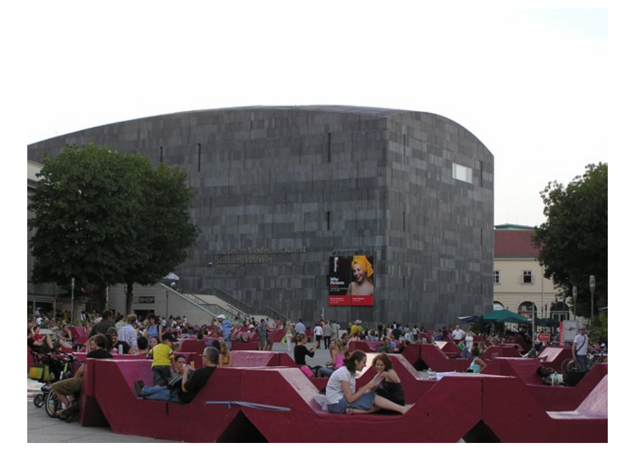
21 MUMOK Museum Moderner Kunst Stiftung Ludwig Wien