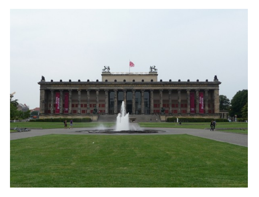
2 Altes Museum in Berlin