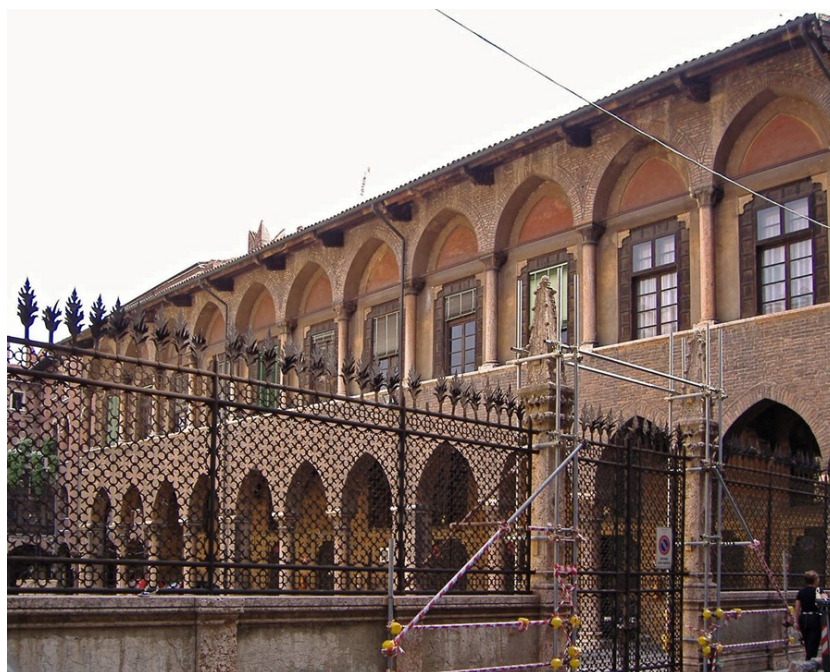
1 Verona, former Sala Grande from the Corso S. Anastasia.

[5] It is clear that, locally at least, the frescoes Altichiero painted in the newly built Sala Grande of Cansignorio della Scala's (1340-75) palace in Verona in the 1360s (Fig. 1) were still thought of as something worth seeing throughout the Quattrocento.