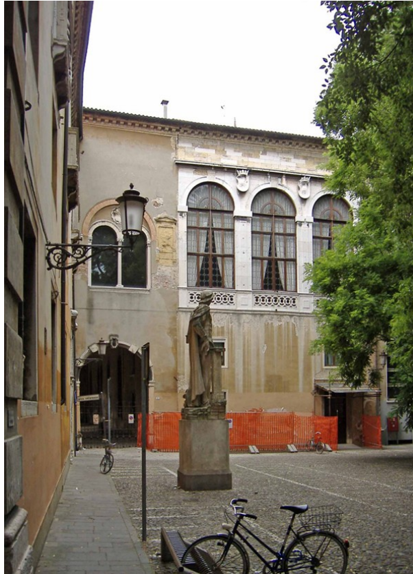
3 Padua, Sala dei Giganti (ex-Sala virorum illustrium) and entrance to former central court of Reggia Carrarese.

[21] His description of the iconography of the hall is predominantly accurate: it contained some, though not all, "imperadori" and many "viri illustri", together with representations of "le opere sue". The Trecento frescoes were destroyed by fire in the sixteenth century, except for the portrait of Petrarch, twinned on the end wall with the repainted portrait of Lombardo della Seta ("a Serico", d.1390). It is not surprising that Sanuto was shown this great hall, the Paduan equivalent of the Sala Grande and similarly part of a Venetian administrative complex after 1406. Biondo had preceded him here too, listing the Reggia among the "belli pelagi" of his day. 29 Once again, even without any reference to authorship of the paintings, it is still remarkable that Sanuto singled it out among all the painted rooms he must have seen throughout the region, many of more recent vintage. In this instance Sanuto's family piety may have been a factor, for the F.S. of his text was Francesco Sanuto, Capitano in Padua in 1480 and responsible, as Sanuto notes, for the restoration of the frescoes.