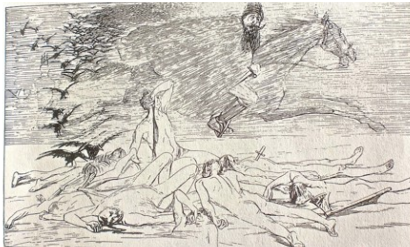
27 Cartoon, L'Égalité (6 October 1889), reprinted in Le Courrier français (27 October 1889)

[57] The source for Rousseau's painting was a cartoon that had appeared in the anarchist magazine, L'Égalité , on 6 October 1889 and which had been reprinted in Le Courrier