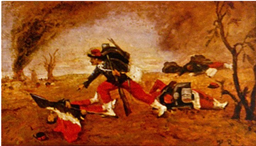
23 Henri Rousseau, The Last of the 51st Rank , 1893 (esquisse); no. 1143, 9th Salon des Artistes Indépendants, 1893