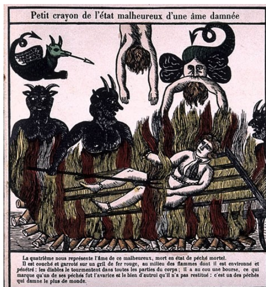
30 Anonymous, Le Miroir du Pécheur , Detail: "Petit crayon de l'état malheureux d'une âme damnée"