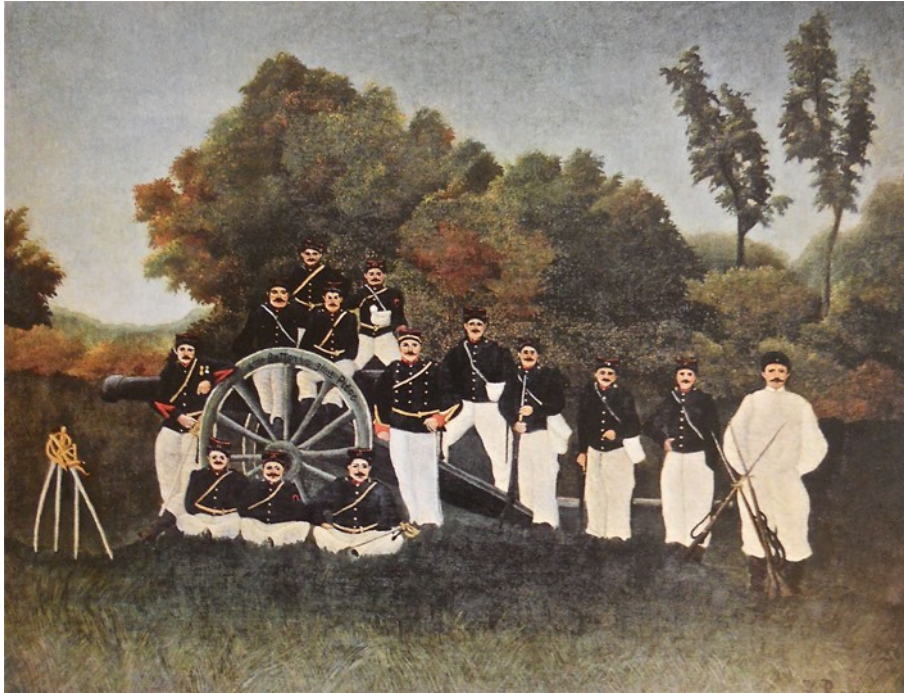
5 Henri Rousseau, Les Artilleurs (4e batterie, 3e piece) (Artillerymen) , 1893-1895, oil on canvas, 79.1 x 98.9 cm. Solomon R. Guggenheim Museum, New York (reprod. from: Henri Rousseau: Jungles in Paris , exh. cat., London 2005, p. 108, no. 21)