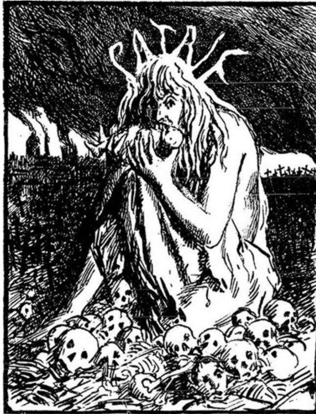
16 Maximilien Luce, Patrie : "Jamais rassasiée l'abominable Goule! Rude garce, madame Patrie: elle mange ses enfants!" 1891, Almanach du Père Peinard 1894, p. 39

[40] Military cultures, particularly "the professional soldier" were assaulted with more virulence than ever by socialists, anarcho-communists and their press, particularly Le Père Peinard . 112 They were supported by the insider and outsider neo-impressionists as epitomized by Luce's scathing antimilitarist cartoons, particularly Patrie , commissioned for Le Père Peinard in which the fatherland was figured as both Medusa and his Medea (Fig. 16). In this issue featuring the assassination of miners at Saint-Etienne and linking it to the massacre at Fournies, the fatherland was personified by Luce as a Medusaesque figure who glares directly at the spectator, her snaked hair encircling her head like a halo articulating the words, " Patrie ." 113 A double identity, Luce's " Patrie " was also depicted as an insatiable Medea devouring her babies, her fang-like teeth being shown about to incise their naked flesh. With skulls nestling at her feet, the city burning behind her and cruciform gravestones punctuating the skyline, the caption aptly reads: "Never will you satisfy the loathsome Ghoul! Rough bitch, Madame Patrie: She eats her children." 114 That Carnot's Third Republican government and its soldiers trained as " le