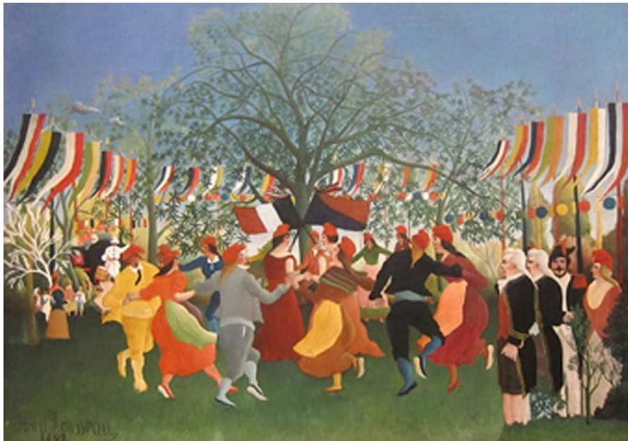
6 Henri Rousseau, Le centenaire d'indépendance (The Centennial of Independence) , 1892, oil on canvas, 11.8 x 157.2 cm. The J. Paul Getty Museum, Los Angeles (reprod. from: Henri Rousseau: Jungles in Paris , exh. cat., London 2005, p. 104, no. 18)

contested the inhumanity of " le corps militaire ," particularly the patriotic duty that impelled it to war at home and abroad. Reviling the heroism of military life and " la gloire " of military victory captured in Le Rêve by Detaille, Rousseau imaged how ordinary men became subjected to the anonymity, rigidity and regimentation of military life after the Military Law, and forced to engage in human slaughter. How they became powerless to resist their bodies being molded into " le corps militaire " and to refuse training in the deadliest forms of land-based armaments was imaged by Rousseau in such paintings as Les Artilleurs (4e batterie, 3e piece) of 1893-1895 (Fig. 5). How they compounded warfare with their bodies and weapons was exemplified by La Guerre . Through the dialogue generated between these paintings of subjection and his other paintings connoting free association as epitomized by Le centenaire d'indépendance (The Centennial of Independence) (Fig. 6) – a painting in front of which visitors danced at the 1892 Salon des Artistes Indépendants and sang " Auprès de ma blonde " – Rousseau, following Peter Kropotkin (1842-1921) and Paul Signac (1863-1935), considered that his art could "awaken popular consciousness." 20