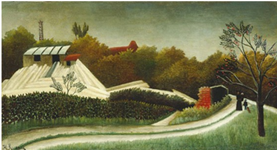
11 Henri Rousseau, Scieries aux environs de Paris (Sawmill, Outskirts of Paris) , 1893-1895, oil on canvas, 25.5 x 45.5 cm. The Art Institute of Chicago (reprod. from: Henri Rousseau: Jungles in Paris , exh. cat., London 2005, p. 138, no. 41)