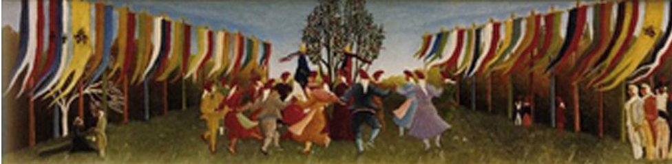
21 Henri Rousseau, Le Carmagnole (Carmagnole), 1893. Harno Museum, Nagano (reprod. from: Henri Rousseau: Jungles in Paris , exh. cat., London 2005, p. 195, no. 79)

from this environment, you would throw yourself into a keenly felt farandole," the accompanying article reads. "It is in front of this palace that the joyful Farandole unfolds; it is there that men free of heart can give themselves over to dance, this pleasure of innocent times." 141 An avid reader of Le Petit Journal Supplément Illustré , as well as many other popular journals, these significations were not lost upon Rousseau.