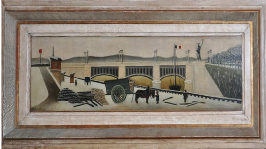
12 Henri Rousseau, Le Pont de Grenelle (View of Grenelle Bridge) , 1902, oil on canvas, 20.5 x 75 cm. Musée de Vieux-Château, Laval (reprod. from: Henri Rousseau: Jungles in Paris , exh. cat., London 2005, p. 138, no. 41)