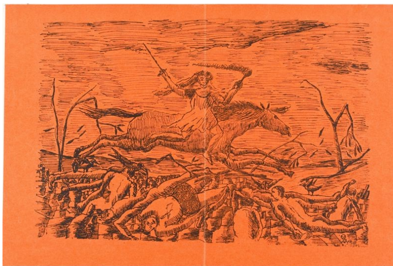
28 Henri Rousseau, La Guerre (War), pen lithograph on red paper, L'Ymagier II (January 1895), facing page 101. Spencer Museum of Art, Lawrence, Kansas

Français on 27 October 1889 (Fig. 27). In keeping with its title, Le Tsar , the most dominant figure in this cartoon is the autocratic Russian Tsar, Alexander III who in 1887 had ordered the hanging of Lenin's brother, Alexander Ulyandov and who, after the Imperial Train crash in October 1888, had sent thousands of working-class revolutionaries to die in Siberia as mentioned earlier. Viewed by French anarchists as a brutal despot, he is depicted on horseback riding roughshod over his people who have been dumped in the frozen wasteland of Siberia to die, vividly illustrating the accompanying caption: "Wherever the mysterious black horse passes, calamity descends, a crime was committed." 162 The analogy to be drawn between the brutality of Tsar Alexander III and the government of Prime Minister, Casimir-Perier, was not lost upon Jarry.