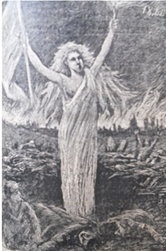
2 Maximilien Luce, " Elle n'est pas morte, foutre!!! ", lithograph. Le Père Peinard 62 (25 May 1890), 9 (full-page illustration)

being commissioned from Maximilien Luce (1858-1941) to commemorate the eighteenth anniversary of "bloody week" (" La semaine sanglante ," 21-28 May 1871) showing the massacre of Communards by conscripted soldiers from which the figure of Liberty bearing the revolutionary torch and banner arises above the caption: "Elle n'est pas morte, foutre!!!" ("Fuck, she is not dead!!!") (Fig. 2). 9