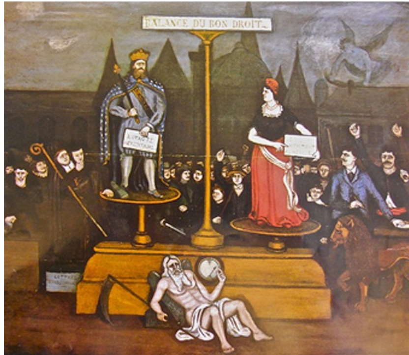
19 Henri Rousseau, La Balance du Bon Droit , Salon des Artistes Indépendants, 1892, whereabouts unknown

its modernization through Léon Bourgeois' solidarism, particularly in terms of the revolutionary idea of fraternity. 135