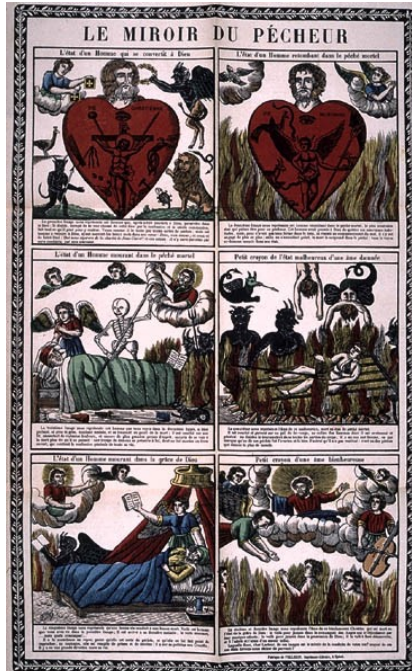
29 Anonymous, Le Miroir du Pécheur , Image d'Épinal , stencil-colored woodcut, 2.67 x 2.14 cm, L'Ymagier I (October 1894), facing page 48.

cones among the corpses, translucent with anoxia." 164 Following Jarry's analogy, the figure of Valkyrie seems to ride horseback across this decimated landscape littered with bloody corpses pecked at by pale-beaked crows, just as Tsar Alexander III had seemed to ride roughshod across his people.