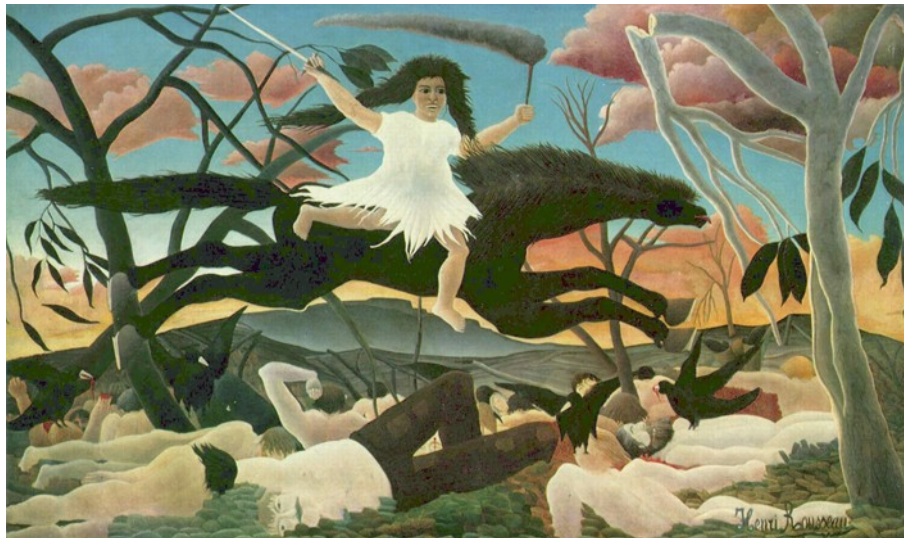
4 Henri Rousseau, La Guerre (War) , c.1894, oil on canvas, 114 x 195 cm, exhibited as no. 725, 10th Salon des Artistes Indépendants , Paris 1894. Musée d'Orsay, Paris (reprod. from: Henri Rousseau: Jungles in Paris , exh. cat., London 2005, p. 102-103, no. 17)