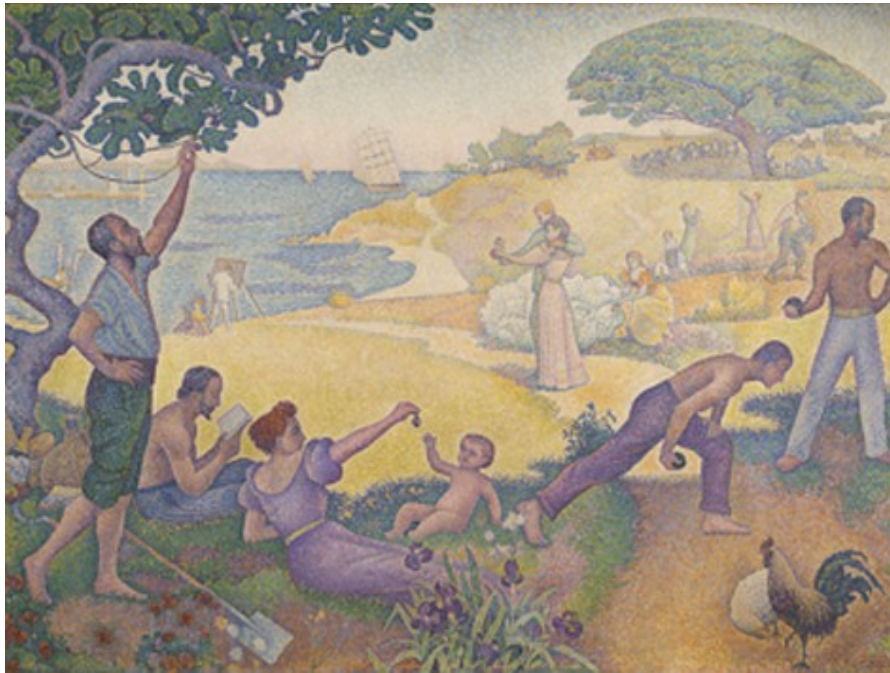
15 Paul Signac, Au Temps d'harmonie: l'âge d'or n'est pas dans le passé, il est dans l'avenir ( In the Time of Harmony. The Golden Age Is Not in the Past, It Is in the Future), 1893-1895, oil on canvas, 310 x 410 cm. Mairie de Montreuil, Montreuil (image kindly provided by the Mairie de Montreuil.)

contour of the land against the sea integrates these women into the natural environment. Following Charles Henry's Chromatic Circle , the broad expanses of the yellow-orange hillside, complementing the lavender of the women's skirts and shadows and the blue of the sea, enhance one another in a way designed to affect the spectator psychologically. 92 Together with the arabesque, they are meant to impart a sense of social harmony and well-being. As Signac explained, "This is the great scientific and philosophical law of contrast." 93