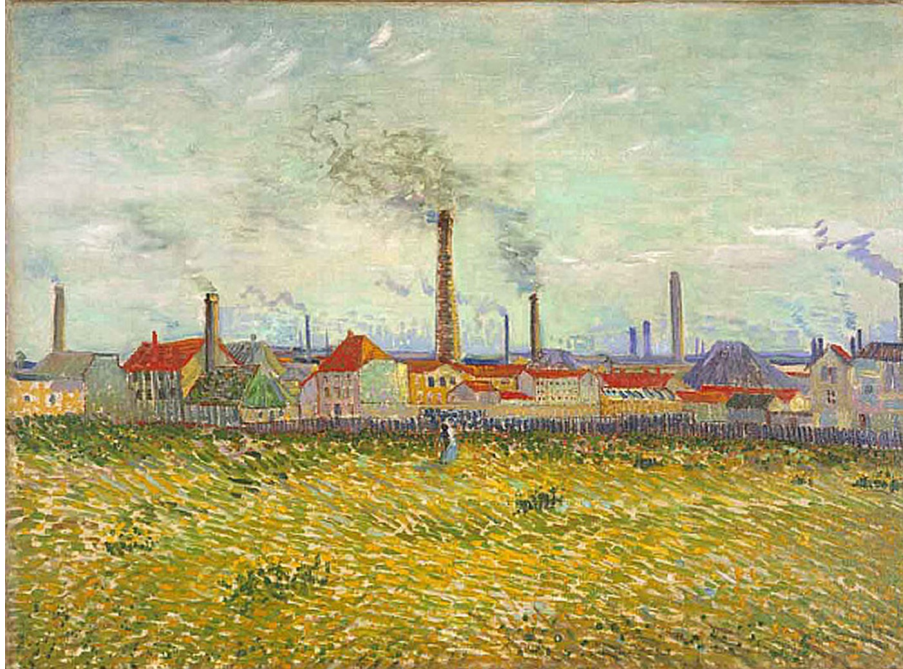
10 Vincent Van Gogh, Usines à Clichy (Factories at Clichy) , 1887, The St. Louis Art Museum, St. Louis, Missouri (reprod. from: Jacob Baart de la Faille, The Works of Vincent van Gogh. His Paintings and Drawings , Amsterdam 1970, no. 317)

which diseases festered, as conveyed by the bile colors in the foreground of Van Gogh's painting and the discolored, thick fetid air in the background displacing a clear blue sky. In this environment circumscribing the so-called dangerous classes, it was also subject to invasive surveillance by " le corps militaire ."