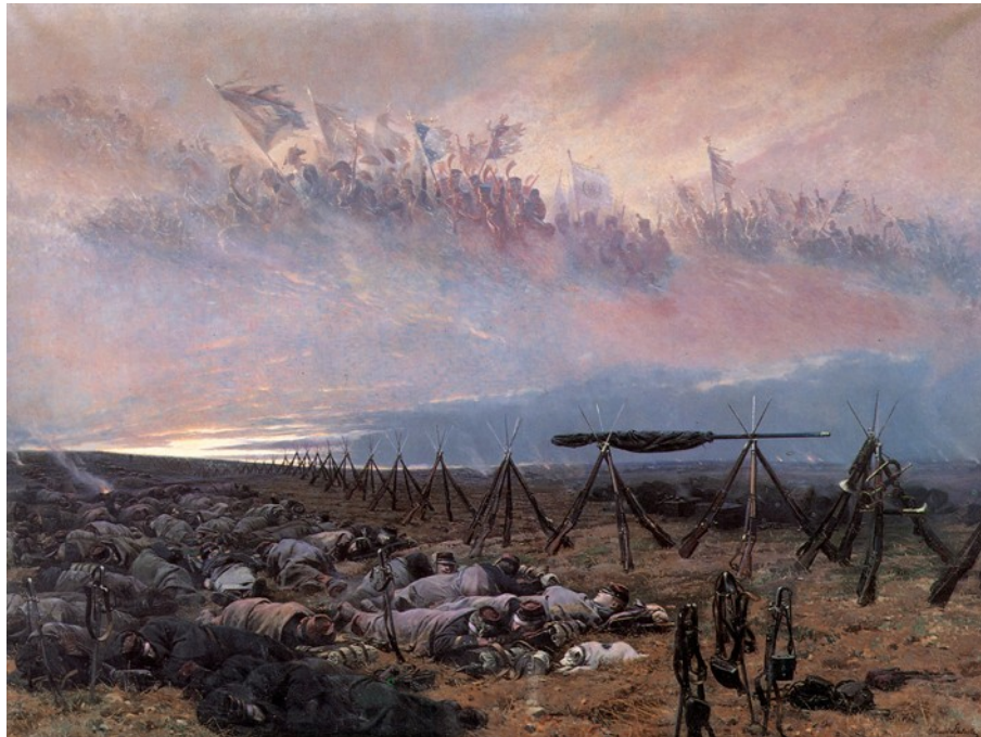
1 Edouard Detaille, Le Rêve (The Dream) , 1888, oil on canvas, 3 x 4 m. Musée d'Orsay, Paris

the resumé of all France's glories from its heroic epochs to our own days. It was an appeal, a lesson, an act of faith." 6 Yet by no means was this view unanimously held.