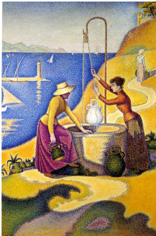
14 Paul Signac, Femmes au puits (Women at the Well) , 1892, oil on canvas, 195 x 131 cm. Musée d'Orsay, Paris (© RMN. Reprod. from: Françoise Cachin, Signac. Catalogue raisonné de l'oeuvre , Paris 2000, p. 110, cat. 234)

communal (rather than private) well. In keeping with Kropotkin's theory of mutualist aid, they appear to assist one another in drawing water from the well and pouring it into a jug. Their mutual aid and interaction differ substantially from the relationships of servitude in which, as Anne Dymond perceptively points out, Signac's workers in Paris are portrayed. 90 Their relationship also differs substantially from factory workers in Paris on an assembly line. Rather than turn away from one another and suppress any other form of verbal communication – knowing that their wages would have been docked for doing so – they face one another and appear to chat, work and leisure having become fused. This is most potently captured by Signac's In the Time of Harmony .