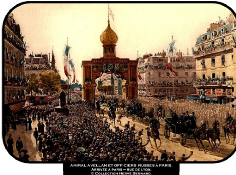
22 "Admiral Avellan et officiers russes à Paris. Arrivée à Paris – rue de Lyon" ("Admiral Avellan and Russian officers in Paris. Arrival in Paris – rue de Lyon") (reprod. from the collection of Hervé Bernard, Fêtes et Alliances Franco-Russes , 1893. Notes de lecture de l'un de mes ouvrages , Livre unique et inédit avec préface du Président de la République, p. 10, http://ecole.nav.traditions.free.fr/pdf/RIEUNIER%20_RUSSE.pdf )

imprisonment in Mazas in 1894, Rousseau completed his huge canvas, La Guerre (Fig. 2). 154