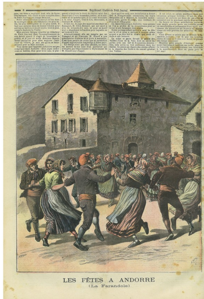
20 "Les Fêtes à Andorre (La Farandole)," Le Petit Journal, Supplément Illustré 20 (11 April 1891), p. 8

terms of "divine right" – signified by his plaque entitled "royauté héréditaire" – while pointing to her plaque saying "Le pouvoir appartient au mérite": "Power must be earned." It was hung next to Le centenaire de l'indépendance (Fig. 6) to show, in Rousseau's words, "our forebears, in short trousers, dancing to celebrate the advent of liberty." 138 Like the group dancing in Signac's Au Temps d'harmonie , they dance La Farandole , the rustic dance popular in the Midi known as the dance of the people. 139