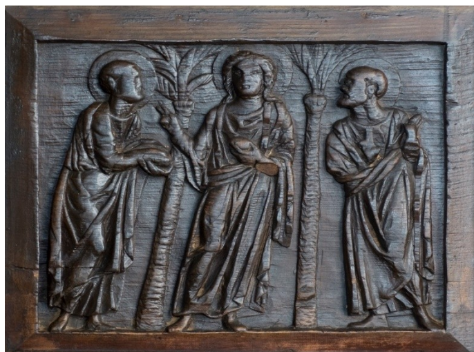
2 Transfiguration (?) , 421-440, cypress wood, 40 x 28 cm, Santa Sabina, Rome

[2] In 1876, Nikodim Kondakov claimed that four of the 18 surviving narrative panels had been integrally re-sculpted in the Early Modern period. 2 At the beginning of the 20th century, however, Adolfo Venturi put forward an idea, which gradually became the