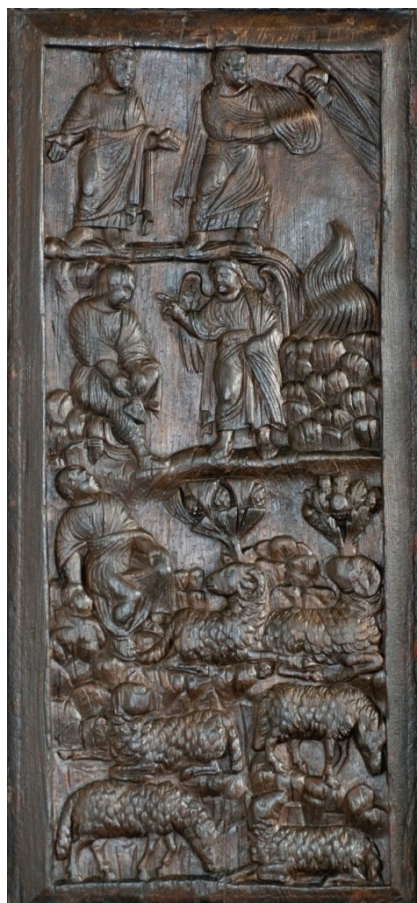
1 Moses the Shepherd , 421-440, cypress wood, 90 x 40 cm, Santa Sabina, Rome