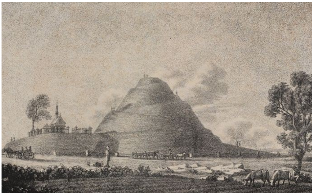
4 Kościuszko Mound in Cracow, after 1823, lithography, 14,8 x 21,9 cm. The National Library, Warsaw

President Wodzicki (Fig. 4). This decision was most probably dictated by a new estimated budget, which suggested the possibility of reaching a satisfactory result with a lower cost than initially assumed. 39 An undeniable asset of the mound as the form of the monument was its durability and local origin, emphasised even by Sierakowski in his architectural treatise from 1812, where he wrote about the "Polish genius" that gave rise to a form of commemoration that was admittedly primitive, but unmatched in its durability. 40