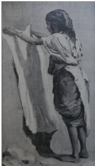
3 Adolf Sandoz, Arab Woman from El Kantara , 1881 (reprod. from Tygodnik Ilustrowany 41 [1913], 805)