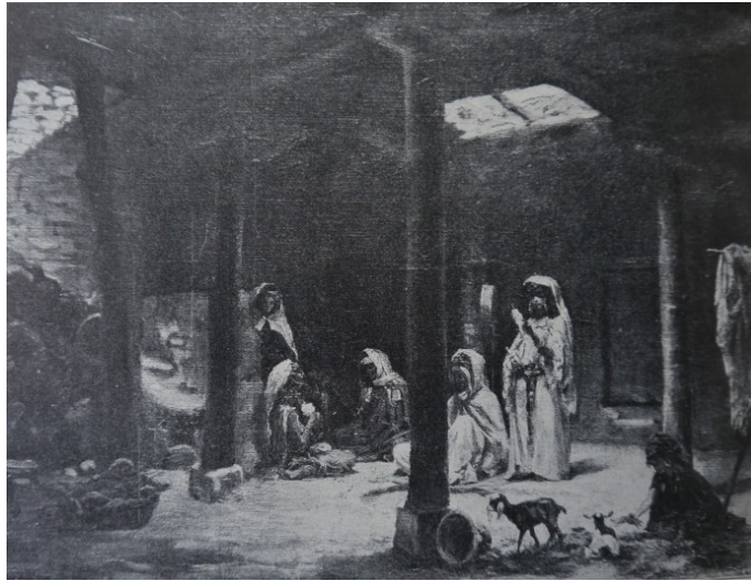
4 Adolf Sandoz, Interior of a House in Biskra , 1879 (reprod. from: Tygodnik Ilustrowany 41 [1913], 805)

[23] A closer look at Sandoz's paintings of Algeria reveals that he chose several popular motifs present also in the works of other painter-travellers fascinated with North Africa. He described Interior of a House in Biskra (Fig. 4), presented in Paris and later also in Poland, in the following fashion: