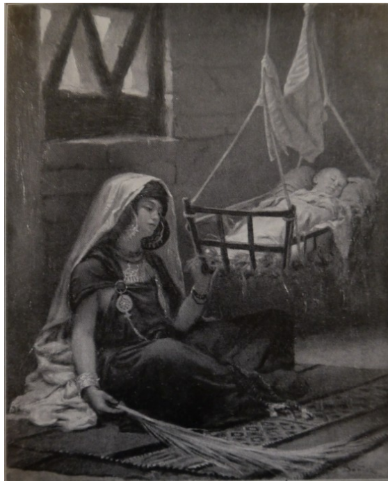
5 Adolf Sandoz, Arab Woman by a Cradle , 1879 (reprod. from: Katalog wystawy sztuki współczesnej , Lviv 1913, 16)

[24] Sandoz also chose a quiet interior of an Arab home as a scene for his Arab Woman by a Cradle (Saharan Woman) . This work is known from a reproduction in an exhibition catalogue from 1913 (Fig. 5). 52 A young woman is sitting on carpets spread on the floor, dressed in an attire typical for people of the region, one that Sandoz took such liking to – a draped vesture fastened with pins. As a married woman she wears braids made of wool covered with a light veil, while her picturesque clothes are complemented with jewellery. The Arab woman is nursing a child sleeping in a cradle suspended from the ceiling. Sandoz addressed here the always popular subject of motherhood, originating from the iconography of the Virgin Mary, as well as Saint Anne, translated however into Oriental reality. The topic of motherhood was also addressed by orientalist painters such as Chassériau, Jean-Baptiste Huysmans, Leroy and Landelle. 53 A figure of a seated Algerian girl in traditional clothing, looking ahead in a melancholy pose, can be found in Louis Ernest Barrias' sculpture adorning Guillaumet's tomb at Montparnasse cemetery.