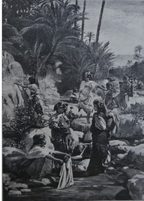
6 Adolf Sandoz, On the Oued Riverbank at El Kantara Oasis , 1881 (reprod. from: Tygodnik Ilustrowany 41 [1913], 805)

The painter showed women and girls from the family of the sheik of El Kantara washing clothes on the river bank. Women are wearing traditional clothing and rich abundant jewellery. Sandoz depicted them in various poses – leaning over the water, carrying the washing, talking, hanging the fabrics. Very clear is his fascination with the grace and picturesque quality of the Algerian women's clothing and beauty. The landscape of El Kantara is seen in the background – its rocky banks covered with palm trees. Water, the miracle emerging in the midst of the desert, concentrated all life – this is where people would find their water, bathe, and wash their clothes. Those daily chores, performed by Arab women, attracted the attention of painters travelling to Algeria: Women washing on the river bank were also depicted by Dinet, Jules Taupin and Francisque Noailly. 61