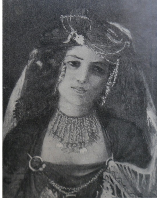
2 Adolf Sandoz, Sheik Mistress of El Kantara , 1881 (reprod. from Tygodnik Ilustrowany 41 [1913], 805)