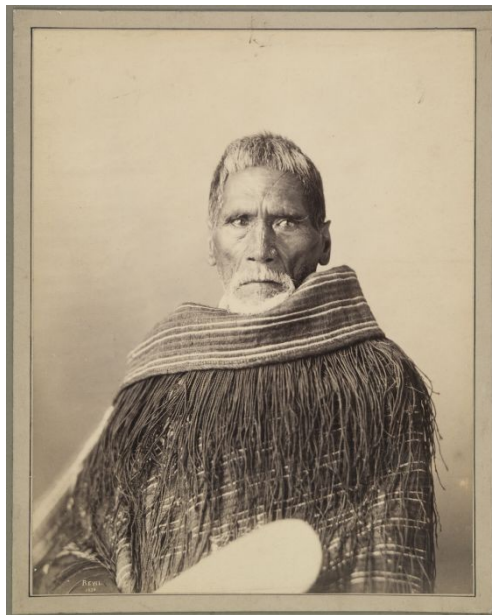
5 Unknown, Rewi Manga Maniapoto (1807-1894), wearing a flax cloak and holding a mere or patu. Übersee-Museum, Bremen, photo collection, inv. no. P15038 38