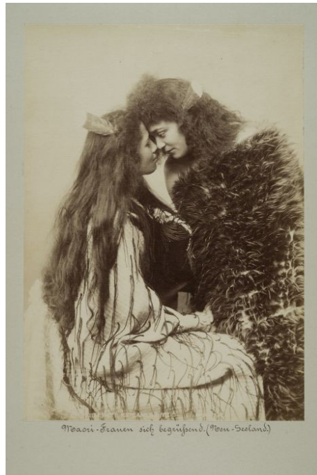
7 Arthur James Iles, Two women, greeting each other (hongi) . Übersee-Museum, Bremen, photo collection, inv. no. P11360 (© Übersee-Museum, Bremen) 44