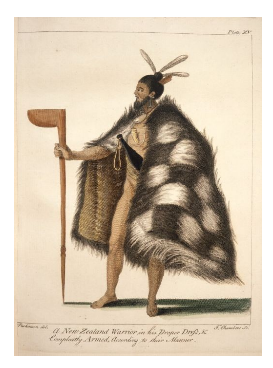
1 Sydney Parkinson, "A New Zealand Warrior in his Proper Dress, & Compleatly Armed, according to their Manner", in: A Journal of a Voyage to the South Seas, in his Majesty's Ship the Endeavour: Faithfully Transcribed from the Papers of the Late Sydney Parkinson, Draughtman to Sir Joseph Banks [...] and Embellished with Twenty-Nine Views and Designs [...], London 1784, pl. 15

As the caption says, the plate shows the "New Zealand Warrior in his Proper Dress & Compleatley Armed according to their Manner", an imposing figure with the muscular body of an Apollo of Belvedere who adopts the classic profile of Ancient Greece, is equipped with Māori weapons and adornments, and is draped in a fine Māori cape, which covers the body like a tent and thus conceals, but also intentionally leaves a part uncovered.<sup>14</sup> Remarkably, this very same warrior