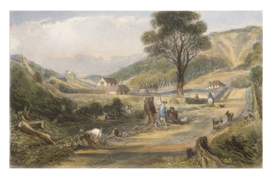
9 Samuel Charles Brees (engraved by Henry Melville), "Mr Brees' Cottage, Karori Road, 1849", hand-coloured engraving, 9.0 x 14.6 cm, in: Samuel Charles Brees, Pictorial Illustrations of New Zealand , London 1847, pl. 9, no. 28

[17] The serpentine, fenced-in road wrested from nature leads to the wooden cottage, which is illuminated by the sun breaking through the clouds. This lighting effect lends - literally - the cultivation of the once wild landscape enlightening features. In the dark foreground debris of the work is still visible: after the clearing of the woodlands, tree stumps protrude, stark and useless, signs of a transitional phase between a wildness that no longer exists and civilisation yet to be implemented. Discarded branches recall cannibalistic scenes, like discarded limbs they lie around in a gruesome memento mori of the vanquished barbarism. The grazing goats also function as intermediaries between the two worlds: on the one hand they are domesticated animals helping the settlers to become prosperous in the future, on the other they are not (yet) fenced in, feeding on what they find on the wayside. And so in the middle ground, at the divide between the two poles of human existence, there is an encounter full of symbolism, between a white, elegantly dressed settler and a man in dark tones, presumably a Māori, sitting on the ground like a vagabond. Exchanging a few words, they lead the viewer to the brighter landscape of British influence.