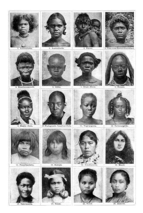
11 Unknown, table of "Menschenrassen" (human races), in: Brockhaus' Kleines Konversationslexikon , 5th ed., 2 vols., Leipzig 1911, , vol. 2, 493

The Māori are perceived as 'other' and as far removed as is possible from European culture and physique, and yet – thanks to the empirical pictorial arrangement, similar to how snail forms or other natural phenomena are set out in a visual sequence – this 'otherness' can indeed be domesticated.