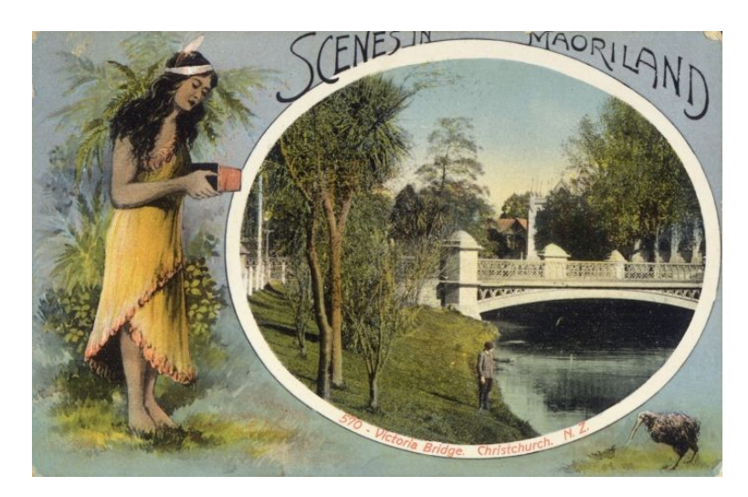
4 Unknown, "Scenes in Maoriland", no. 570: "Victoria Bridge. Christchurch. N. Z.", postcard, ca 1910, photolithograph, 8.9 x 13.9 cm

the more 'English' colonial territory. On a postcard from 1910 the indigenous is present in the form of an attractive Māori woman (fig. 4).<sup>20</sup>