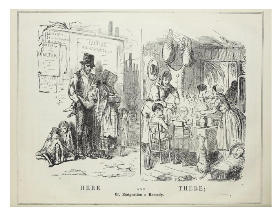
7 John Leech, "Here and There; Or, Emigration a Remedy", caricature in: Punch 15 (July to December 1848), 27 (https://digi.ub.uni-heidelberg.de/diglit/punch1848a/0035/image)

On the left is a ragged and starving family with four barefooted children, behind them a wall with posters (one warning against vagrants) and factory chimneys. The child hanging limply in the father's arms may even be dead. In stark contrast, life in the colonies is depicted as one of prosperity and happiness for families. Well-nourished and dressed in fashionable Victorian clothes, the family is gathered around a table in a bourgeois home that fits the British ideal. Like living in a land of milk and honey, further supplies are piled next to the food on the table. Half a pig and two hams hang from the ceiling, and there's obviously more than enough for the family dog. And a girl charitably hands a steaming dish to a very dark indigenous man, who however remains outside of the window and cannot disturb the domestic bliss of the interior. While the beggar from the industrialised city has moved up in the world, his place has now been taken by the indigenous man. Ferns seen through the window locate the scene overseas. The shovel leaning against a chair indicates the settler is involved in cultivating work in every respect.