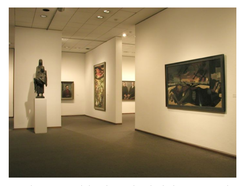
4 "Kunst in der DDR. Eine Retrospektive der Nationalgalerie", Neue Nationalgalerie, Berlin, 25 July 2003 – 26 October 2003, a view of the exhibition design

[25] The decision to compose the exhibition in a regional key was undoubtedly an excellent idea. However, the amount of space assigned to particular art centres may be seen somewhat puzzling. While East Berlin and Dresden artists were granted three and two rooms respectively, the Leipzig School was showcased in one room, and a poorly illuminated one at that. The same amount of space was devoted to Constructivism, an intriguing phenomenon which nonetheless developed on the fringes of the East German mainstream. With distorted proportions, the role of the Leipzig School was severely diminished. Those visitors who knew little about East German art could have developed an impression that it was on a par with avant-garde Constructivism, while the paintings of "Berlin melancholia" were ranked higher than Leipzig's "images of wrath", which could not be the case because of the latter's content: politicised and highly charged with ideology. 60