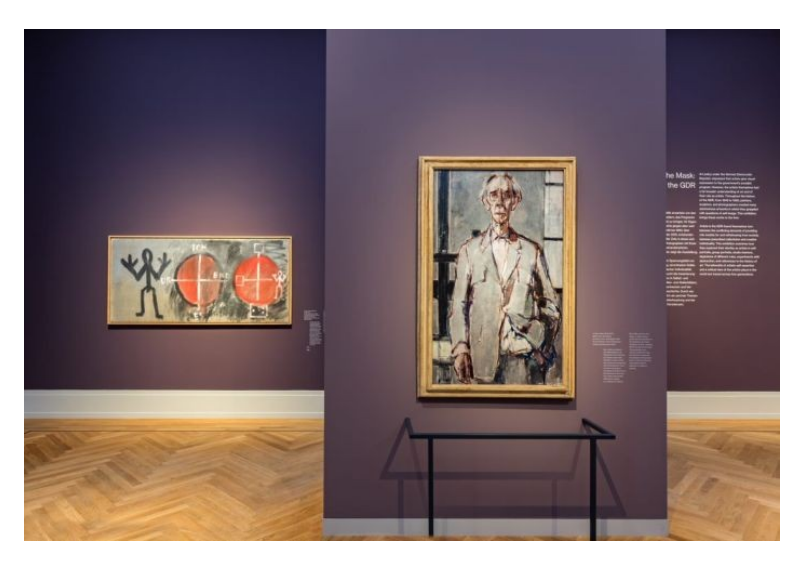
5 "Hinter der Maske. Künstler in der DDR", Museum Barberini, Potsdam, 29 October 2017 – 4 February 2018, a view of the exhibition design

[29] "Hinter der Maske: Künstler in der DDR", an exhibition which marked the launch of the Barberini Museum in Potsdam in October 2017, could have possibly popularised East German artists and the social, political, and cultural roles they played in the GDR (figs. 5 and 6). A speech delivered by the President of the Federal Republic of Germany, Frank-Walter Steinmeier, was undoubtedly a prominent symbolic gesture which attested to the evolution in the field of German-German remembrance after 1989. In his speech, President Steinmeier called the exhibition "a milestone on the pathway to mutual understanding", and works on display as "art that belongs to our shared heritage". 70