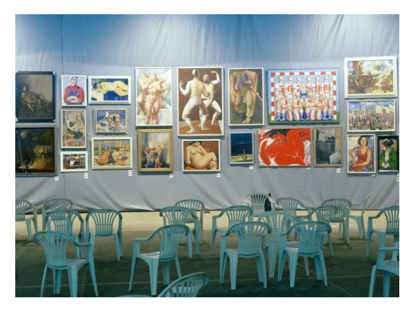
1 "Aufstieg und Fall der Moderne, Part III: Offiziell/Inoffiziell – Die Kunst der DDR", Kunstsammlungen Weimar, Mehrzweckhalle, 9 May 1999 – 26 September 1999, a view of the rotunda-like exhibition design

Exhibitions ("Die Kunst dem Volke – erworben: Adolf Hitler").<sup>47</sup> In the upper storey, which had served as a factory floor, curator Achim Preiß (b. 1956) showcased the art of the former GDR (Figs. 1 and 2).