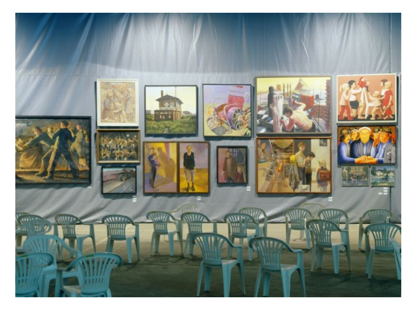
2 "Aufstieg und Fall der Moderne, Part III: Offiziell/Inoffiziell – Die Kunst der DDR", Kunstsammlungen Weimar, Mehrzweckhalle, 9 May 1999 – 26 September 1999, a view of the rotunda-like exhibition design

[21] Appalled artists took the liberty of removing their paintings from display. The case was taken to court. Eventually, the exhibition was closed earlier than planned.<sup>49</sup> Neo Rauch (b. 1960), a native of Leipzig and disciple of Bernhard Heisig and Arno Rink, described it thus: