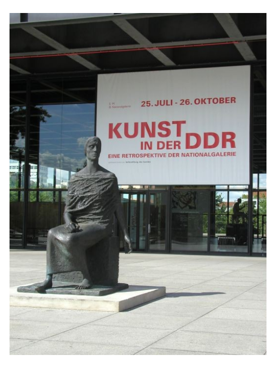
3 "Kunst in der DDR. Eine Retrospektive der Nationalgalerie", Neue Nationalgalerie, Berlin, 25 July 2003 – 26 October 2003, a view of the exhibition design

the task of organising this large undertaking. The choice of curators could be read as a statement, since after the unification the vast majority of texts on the art of East Germany were penned by West German art historians and critics.<sup>57</sup>