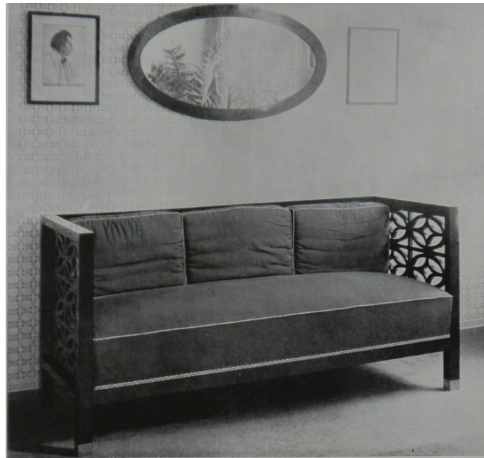
3 Koloman Moser, a sofa from a suite of furniture in Mr and Mrs Hellmanns' drawing room, Vienna, 1904 (reprod. from: Deutsche Kunst und Dekoration 16 (1905), 532)

Museum, Vienna; Fig. 3). Juxtaposed with upholstered seats, the openwork chair backrests could bring Biedermeier to mind. The sofa, where a soft seat was juxtaposed with openwork armrests, showed a similar inspiration. Moser used intersecting mullions in his display cabinet and writing table designs. The suite produced an aura of restraint, elegance, and balanced proportion; its decorative effect was obtained through a juxtaposition of geometrical elements with decorative surfaces and colourful fabrics.