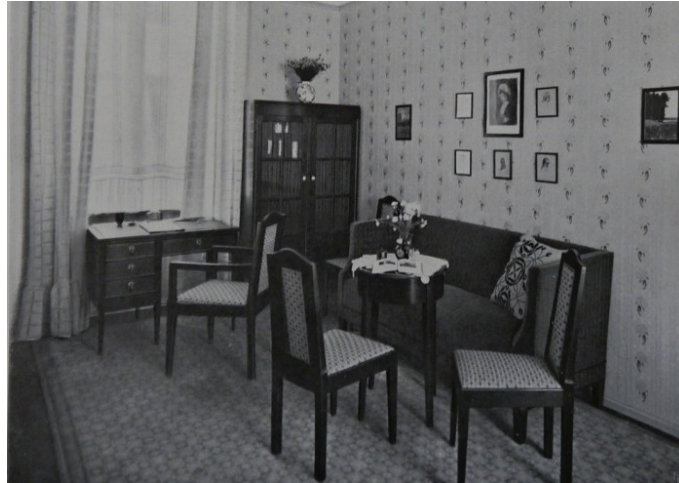
4 Bruno Paul, Typenmöbel, ca. 1909 (reprod. from: Die Kunst 12 (1909), 91)