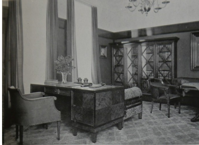
2 Bruno Paul, study, Herxheimer Villa, Frankfurt am Main, 1910-1911 (reprod. from: Deutsche Kunst und Dekoration 29 (1911/1912), 149)