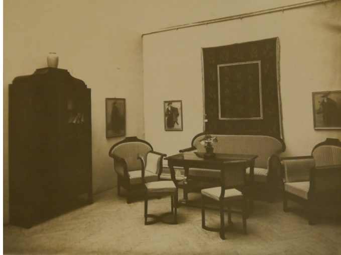
13 Józef Czajkowski, drawing room, showcased at the Palace of the Arts, Kraków, 1918

The drawing room was provided with a suite of walnut furniture (Fig. 13). 46 The suite was similar to those of Biedermeier in that it comprised a sofa, armchairs, chairs, and a table; it was also complemented with a chest of drawers and a wardrobe with glazed mullion windows. As was the case with the study, Czajkowski used volute-capped armrests, arched lines in the backrests of the sofa and armchairs, and wood veneer decorations (see the chest of drawers in the photograph). A bedroom suite of ash wood furniture also showed the influence of Biedermeier. In the design, Czajkowski abandoned arched lines and volutes in favour of refined simplicity, bringing out the beauty of wood and the picturesque wood grain details in the wood veneer decorations that he applied to the bed, chest of drawers, wardrobe, and vanity table. He also borrowed certain typically Biedermeier solutions: he placed a fine fabric canopy above the bed and mounted a psyche mirror on the vanity table.