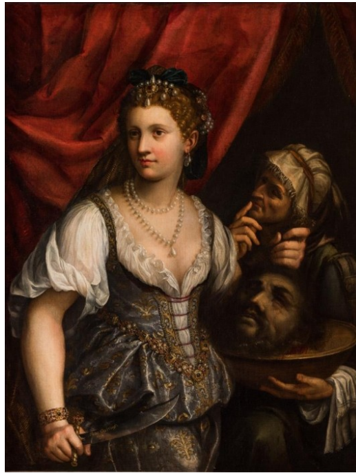
3a Fede Galizia, Judith with the Head of Holofernes , 1596, oil on canvas, 120,7 × 94 cm. The Ringling Museum of Art, Sarasota, inv. SN684