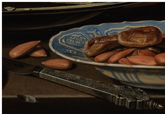
4b Detail from Fig. 4a

[20] The wording of women artists' signatures also resembles that of their male colleagues in many respects. They are likewise predominantly written in Latin and – at least in Italy – often use the learned imperfect faciebat (or pingebat ), which notoriously goes back to a passage in Pliny's Historia naturalis , instead of the simple fecit . 59 There are, however, recurring motifs that are typical of women's signatures, especially until the early seventeenth century: the most obvious is the indication of gender, marital status, and kinship, especially the reference to father or husband.