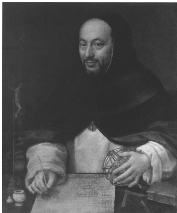
5 Sofonisba Anguissola, Portrait of a Dominican Astrologer , 1555?, oil on canvas. Formerly Calligaris Collection, Terzo d'Aquileja (from: Sofonisba Anguissola e le sue sorelle [1994], 20)