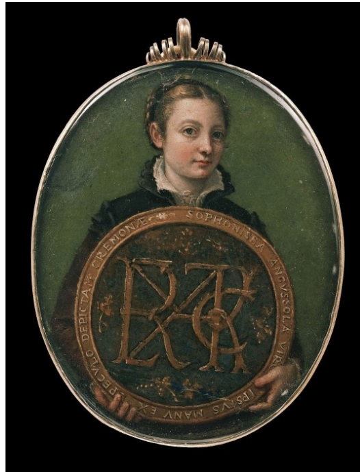
2 Sofonisba Anguissola, Self-Portrait , ca. 1554, oil (?) on parchment, 8,3 × 6,4 cm. Museum of Fine Arts, Boston, inv. 60.555

[19] There are, however, a few instances where the integration of the name into the painting can be described as specifically 'female' – insofar as the signature of a male artist would not make sense in the same place or would not open up the same semantic field. A case in point is the first version of Fede Galizia's Judith with the Head of Holofernes , now in Sarasota (Fig. 3a): by inscribing her signature "Fede Galitia f(ecit) / 1596" on the blade of Judith's sword (Fig. 3b), the artist not only claimed authorship of the pictorial representation, but also, identifying with the biblical heroine, of the action itself. The literal meaning of her first name ( fede = faith) reinforces the association with Judith, the epitome of female strength of faith and virtue. 57