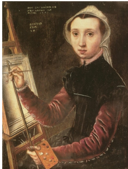
6 Catharina van Hemessen, Self-Portrait at the Easel , 1548, oil on oak panel, 32,2 × 25,2 cm. Basel, Kunstmuseum Basel, gift of the Prof. J. J. Bachofen-Burckhardt-Stiftung 2015, inv. 1361 (© Kunstmuseum Basel)

[24] These characteristics of woman artists' signatures can easily be explained by the social and legal position of women in the early modern period, which generally necessitated a reference to a man, be it the father or the husband. 73 This does not apply, however, to two further peculiarities, both of which can be found in the signature of Catharina van Hemessen's self-portrait in Basel: EGO CATERINA DE / HEMESSEN ME / PINXI 1548 // ETATIS / SVÆ / 20 (Fig. 6). 74