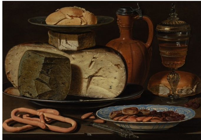
4a Clara Peeters, Still Life with Cheeses, Almonds and Pretzels, c. 1615, oil on panel, 34,5 × 49,5 cm. Mauritshuis, The Hague, inv. 1203