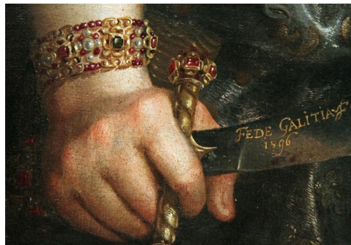
3b Detail from Fig. 3a

Entirely unthinkable for a male colleague would have been a device like that of Clara Peeters, who signed six of her still lifes with her name on the handle of a bride's knife, possibly a depiction of her own one (Fig. 4a, b). 58