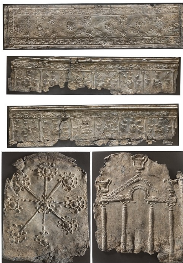
Figs. 7a-7e. Lid, long sides, and end sides of coffins, Phoenicia, Tyre (present Lebanon), AD 2nd–3rd centuries, lead. Musée du Louvre, Paris, AOR 7 (lid), AOR 8A-B (long sides), AOR 9C-D (end sides)

These panels, intended for the Museum für Kunst und Gewerbe, were delivered to Hamburg in March 1943 64 . They were repatriated with the first shipment from Hamburg to the CRA in Paris on 22 October 1948. The fragments, proposed to the First Selection Committee on 27 October 1949 (when the German number 1943/2 appeared for the first time in the documentation) and retained at the Second Selection Committee on 17 November 1949, were assigned to the French Musées nationaux in 1951.