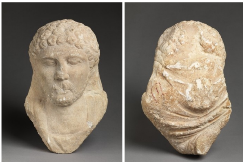
Figs. 2a, 2b. Funerary bust of a man, Cyrenaica (present Libya), first half of the second century AD, marble; on the back is a sculpture of a draped female figure (fragment), reused for the execution of the bust. Musée du Louvre, Paris, AOR 10

[13] The sculpture was seen in Derna (Libya) in 1909, but the provenance of this object between the early 20th century and its confiscation by the ERR is still under investigation. 26 The artwork is mentioned under the name “Marmor-Büste” in a list of crates containing objects from France inventoried as “Unbekannt” (unknown), a category used when the ERR did not identify the owner 27 or did not wish to display the name of the owner 28 . It belongs to a lot with the number UNB 25, including two other stone heads, a bronze head, and a pedestal for a statue. According to Rose Valland, these items were packed and crated for Kurt von Behr, head of the ERR 29 . The head appears again on an undated list of objects packed at the Louvre by the Pusey-Beaumont-Crassier Company for their shipment to Germany 30 . After the war, the head was repatriated to France by train from Buxheim, via Munich. It reached Paris on 4 March 1946, in a box numbered 44bis, which also contained ceramic objects from the Sèvres Manufactory 31 . Proposed and accepted at