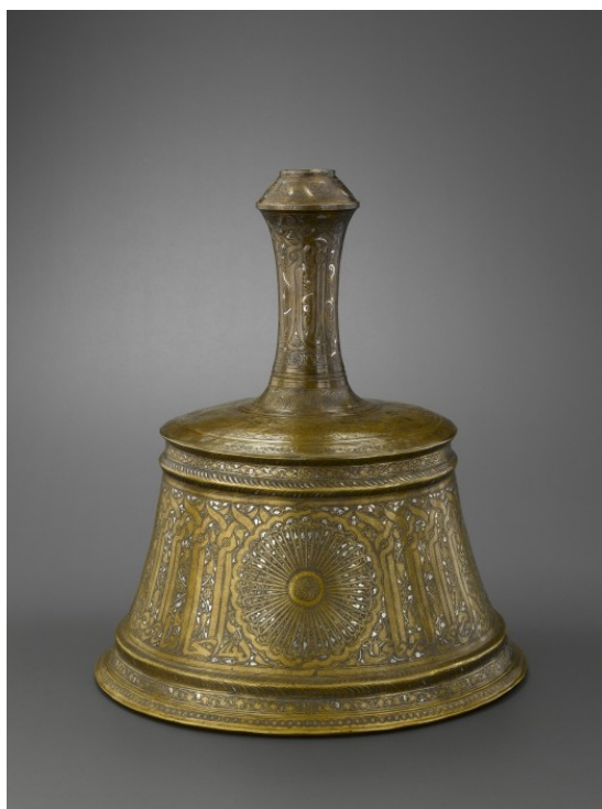
Fig. 5. Candlestick bearing the name of the Mamluk Sultan Hajj II, Egypt or Syria, 1389, copper alloy inlaid with silver. Musée du Louvre, Paris, AOR 1941/96

[19] Three pieces of metalwork sold by Hindamian in Paris in 1941 to Düsseldorf are now in the Louvre: two Iranian basins from the 14th century (AOR 1941/92-94, AOR 1941/93), having respectively cost 4,000 and 5,000 francs, and a Mamluk candlestick (AOR 1941/96; Fig. 5), having cost 40,000 francs. They were sent to Düsseldorf at the request of Adolf Wüster, the cultural attaché at the German Embassy in Paris during the war who played a key role in plundering operations. Their provenance could be as diverse as the sources of any Parisian dealer between the two World Wars; beyond the fact that they transited through dubious wartime channels, nothing is yet known of their former history.