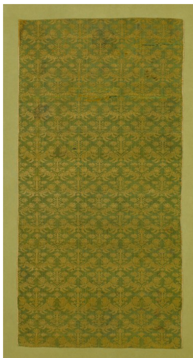
Fig. 3. Fragment of textile with lions, Spain or Sicily, 14th or 15th century, silk damask. Musée du Louvre, Paris, AOR 1941/104