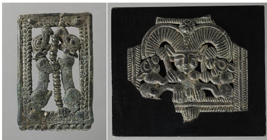
Figs. 8a, 8b. Plaque with two confronted felines ( left ) and pinhead with a "master of animals" ( right ), Luristan (Iran), beginning of the first millennium BC, bronze. Musée du Louvre, Paris, AOR 1 and AOR 3

[29] The six objects AOR 1 to 6 share the same wartime path. They belong mostly to a group of bronze pieces from the Luristan region, a western Iranian province, and date to the beginning of the first millennium BC. Five bronzes correspond to the typical Luristan Iron Age production: a rectangular open-work plaque ornamented with confronted felines (AOR 1; Fig. 8a); a rectangular open-work pinhead representing a mouflon-man taming felines (AOR 3; Fig. 8b); and finials in the shape of roaring confronted felines, whose function is not determined (AOR 2, AOR 5, AOR 6; Figs. 9a-9c). The outlier is a handle in the shape of a goatfish (AOR 4; Fig. 10), attributed to the Luristan region but dated to the Parthian period, circa the first and second centuries AD.