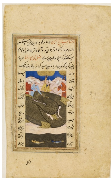
Fig. 6. A giant fish of the Caspian Sea (page from Book of the Wonders of Creation by Qazwini), Iran, probably Shiraz, 16th century, ink, colors and gold on paper. Musée du Louvre, Paris, AOR 4243

[23] The most important part of the AOR kept in the Département des Arts de l’Islam is a group of paintings on paper. Out of the ten that are now in the Musée du Louvre, nine are detached folios of illustrated manuscripts, and among them, six come from the same manuscript, a Book of the Wonders of Creation by Qazwini (AOR 4239 to AOR 4244; Fig. 6).