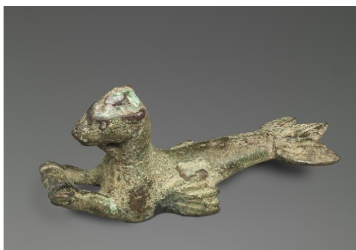
Fig. 10. Handle in the shape of a goatfish, Iran, Parthian empire, 1st–2nd centuries AD, bronze. Musée du Louvre, Paris, AOR 4

[30] Breaking into the art market in the 1920s and 1930s and coming from clandestine excavations or commercial excavations authorized by Iranian legislation, Luristan bronzes fascinated a whole prewar generation of collectors and dealers who were passionate about these inventive and enigmatic pieces. The craze for this type of object led to the fabrication of many forgeries as early as the 1930s and 1940s, resulting in a corruption of our knowledge of genuinely ancient Luristan bronzes 69 . With the exception of a few pieces appearing at the end of the 19th