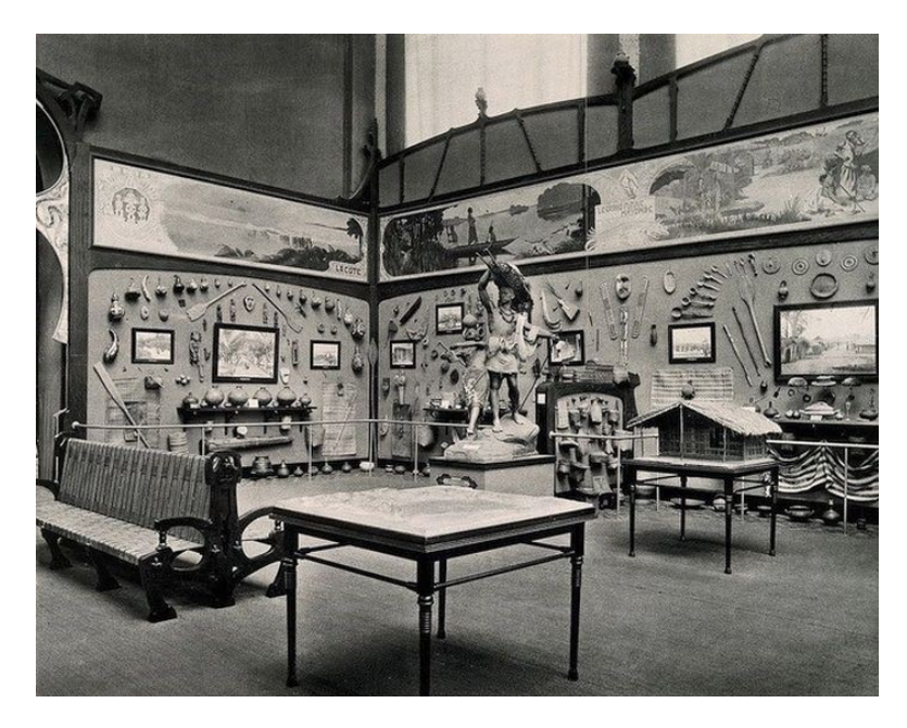
2 Musée du Congo, set up in 1897 as part of the Brussels International Exposition of 1897 at the exhibition grounds in Tervuren, interior view, photographer: Albert Édouard Drains (Alexandre), 1897, collotype, 21,9 × 22,7 cm. Wellcome Collection, London, 22893i

The aesthetic form of the presentation, the lining up of similar objects on the wall, treated them like the products of an industrial society and not only echoed the representative 'neo-baroque' arrangement of the walls in the Hall of Honour [where the most important artists of Belgian Art Nouveau were represented – my note], but extended it to the entire exhibition.<sup>20</sup>