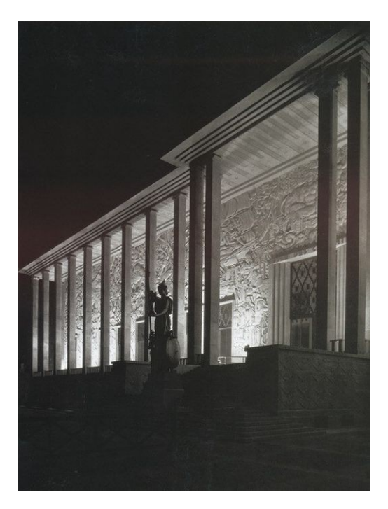
3 Palais des Colonies at the Exposition coloniale internationale , Bois de Vincennes, Paris 1931, south façade at night, photographer: Jean Gilbert, photography, 17 × 23 cm. Musée du Quai Branly, Paris, PP0133836

[15] The aesthetic staging of colonial culture in a kind of 'comprehensive synthesis', as it was first systematically done by the artists of the Belgian Art Nouveau, is once again revived in the twentieth century at the Paris Colonial Exhibition of 1931 – now on the basis of the modern Art Deco ornament. The formal language is derived from the innovations of the highly successful 1925 Exposition internationale des arts décoratifs et industriels modernes in Paris. The idea of an independent, international colonial exhibition in Paris, however, arose from the colonial sections of the previous world exhibitions of 1878, 1889 and 1900. The modern Art Deco ornament incorporates the exotic as a fashionable currency in its set of motifs. The modern ornament does not develop an own aesthetics, but follows – just as the contemporary visual advertising – eighteenth and nineteenth century motifs. The fantastic image of an intact colonial world was created, which was aimed at stabilizing and promoting colonialism, as well as highlighting its alleged advantages beyond any possible criticism.