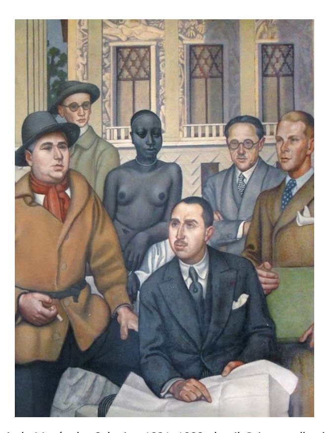
4 Louis Bouquet, Souvenir du Musée des Colonies , 1931–1933, detail. Private collection (reprod. from: Lynne Thornton, Les Africanistes, peintres voyageurs: 1860–1960 , Paris 1990, 31)

white men is an anonymous black woman, whose facial features are reminiscent of the Black American and later French dancer Josephine Baker. She performed with the dance revue "La Revue Nègre" at the Exposition of 1925 as well as at the Paris Colonial Exhibition. Baker's expressive and permissive performances embodied the erotic and exotic attraction of Black culture to a predominantly white audience.<sup>27</sup>