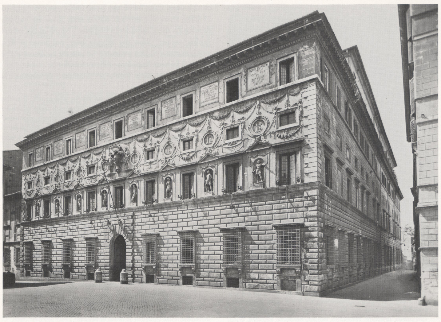
1. Rome, Palazzo Capodiferro-Spada

"Dopo, avendo il Vasari fatto sotto il palazzo nuovo, primo di tutti gli altri, il disegno del cortile e della fonte, che poi fu seguitata dal Vignola e dall'Amannato, e murata da Baronino ..."<sup>15</sup>