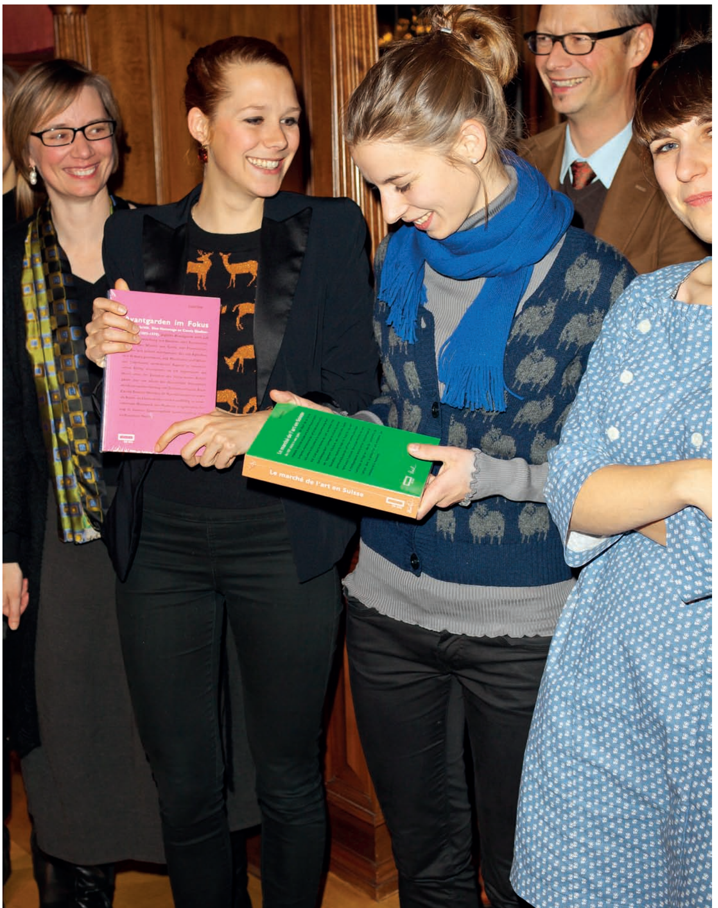
SIK-ISEA presents recent publications during the award of the «Förderpreis Kunstwissenschaft» by the Alfred Richterich Stiftung and the Swiss Association of Art Historians (VKKS)