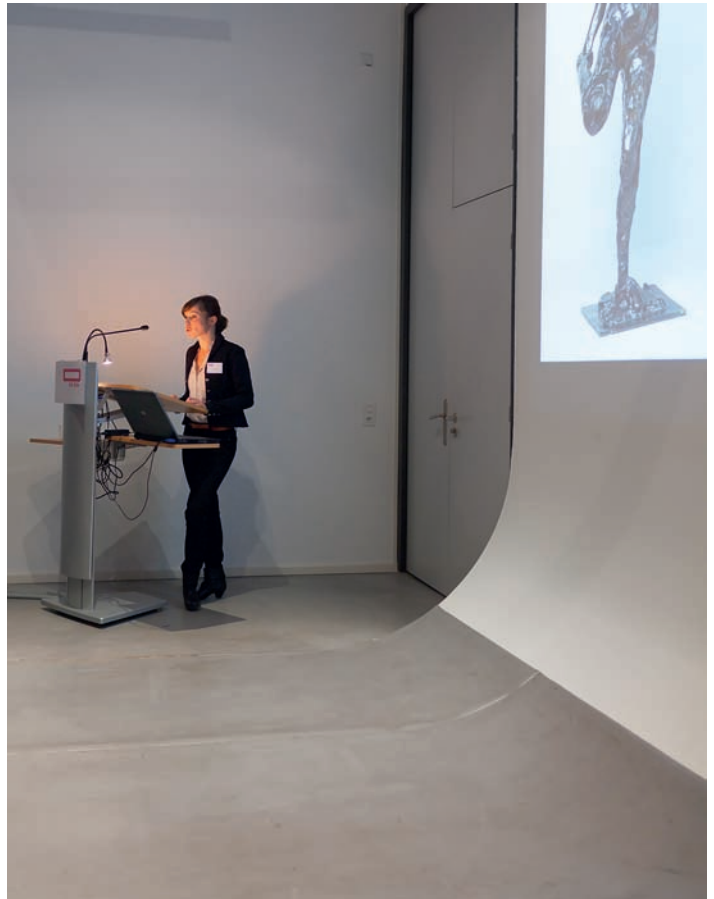
Presenting research at the international colloquium «Authentizität in der bildenden Kunst der Moderne»