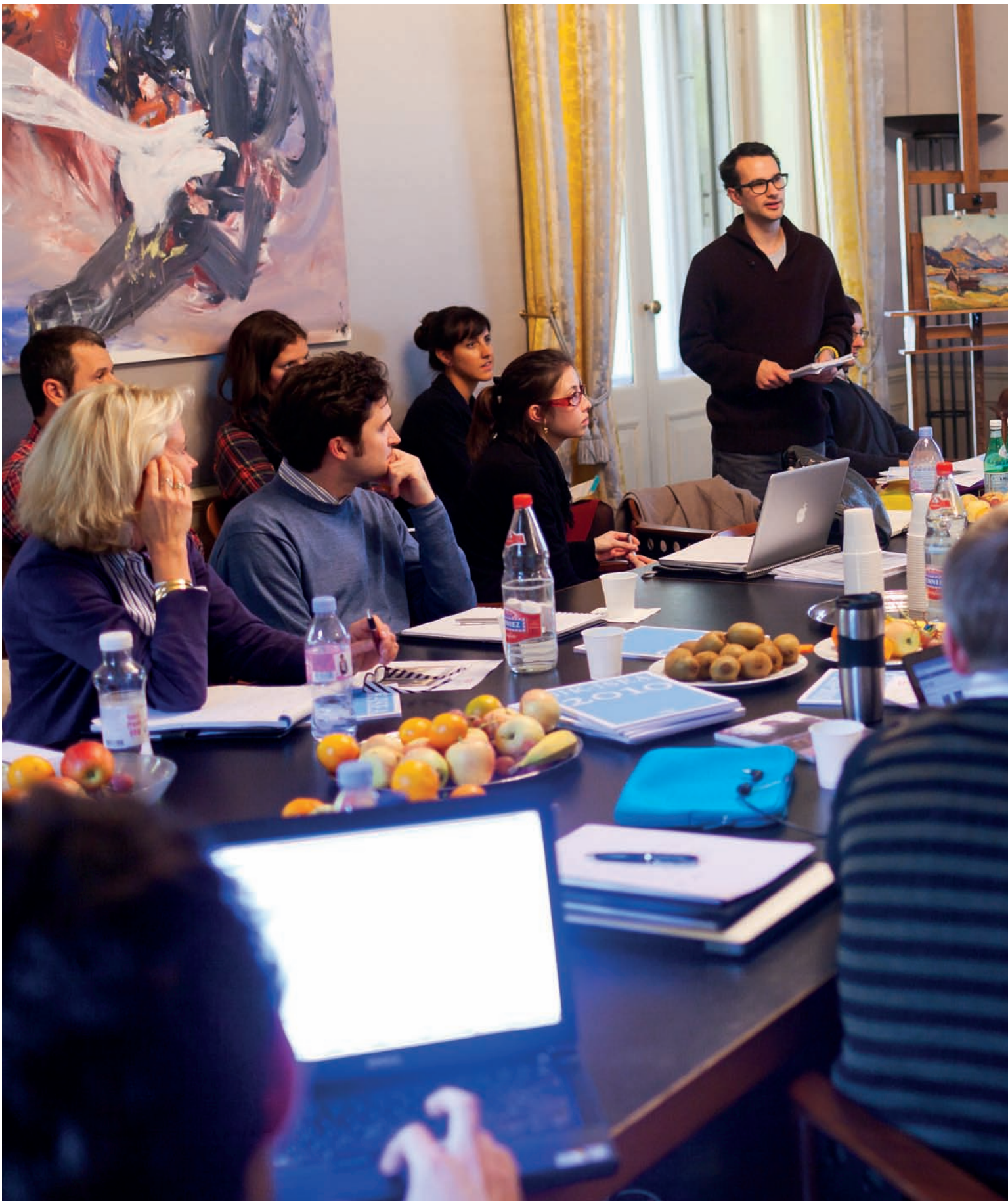
SIK-ISEA provides a course module for the «Executive Master in Art Market Studies» offered by the University of Zurich