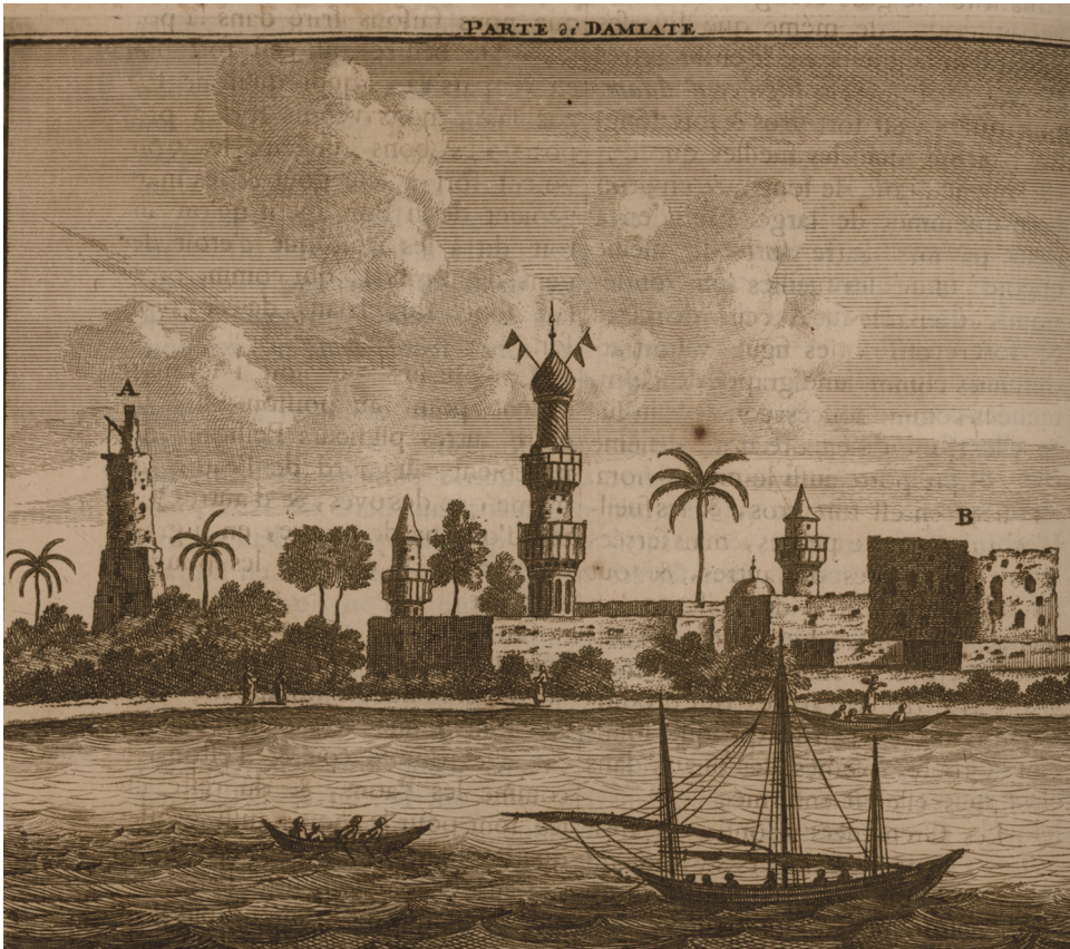
Fig 3: View on Damietta. Drawing by C. de Bruyn (Gaspar 2014, 181, fig. 70).

also stood in the eastern delta near Damietta, and that well into the seventeenth century. We owe this insight to the fine observations of a Dutch traveler by the name of Cornelis de Bruyn: