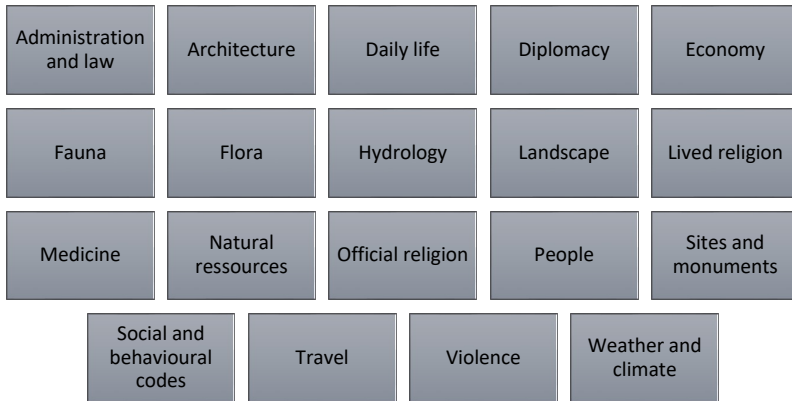
Fig 1: Main categories indexed in the database.

At the first stage, the EETA project in Trier has worked to search and collect editions of travel accounts with the aim of creating a complete list for the period under consideration. At the second stage, the accounts were read, collated and an extensive index of their content was created. From an Egyptological perspective, descriptions of archaeological sites and monuments were of key interest, but the index is by no means limited to that. Indeed, we have tried to capture the full range of topics covered in the reports and have organized them with a mind to reflect modern research agendas and disciplines. In this way, we have aimed to create a heuristic tool for a wide range of scholars who may approach the travel accounts from different perspectives. It was also our aim to make this data openly accessible to researchers from around the world. The main topics, which are often further divided into several subcategories, cover: